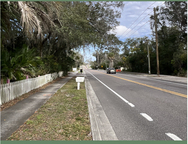
S.R. 434 NORTHBOUND

YOU'RE INVITED: During this community event, solutions will be presented for public feedback. Your participation and involvement is a critical component of the study process. We invite you to attend this community event and stay involved in the process.