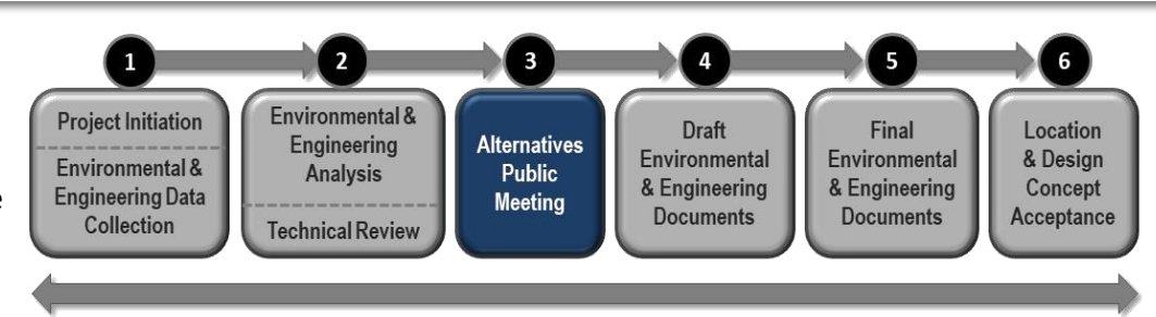
Continuous Public Involvement

A PD&E Study is a process conducted by the FDOT that meets state and federal requirements put into place as part of the National Environmental Policy Act (NEPA) of 1969. This process involves a combination of planning, engineering analysis, environmental analysis, public