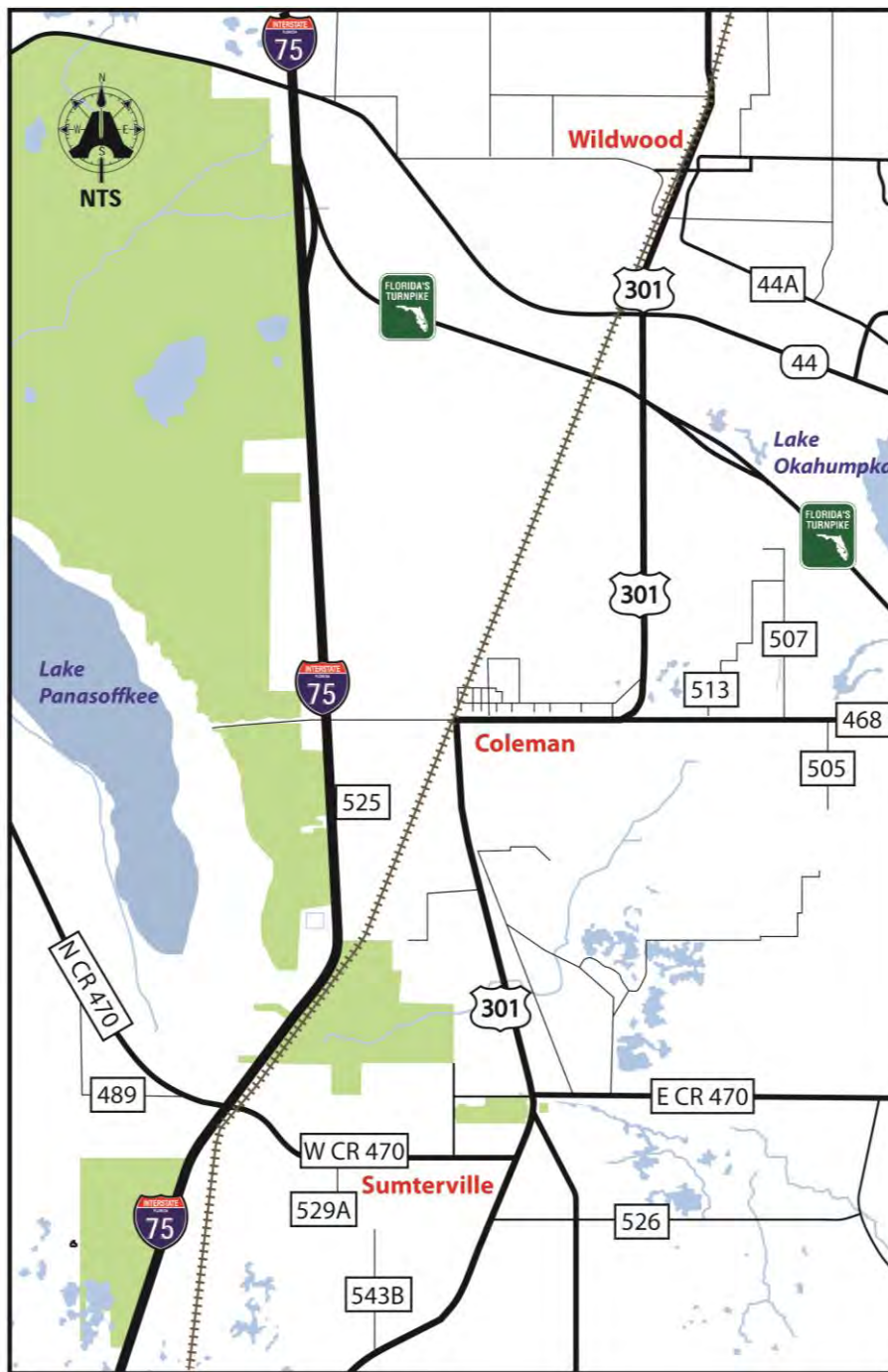
Figure 3-1 | Project Location Map

The Project Location Map is shown on the following page.