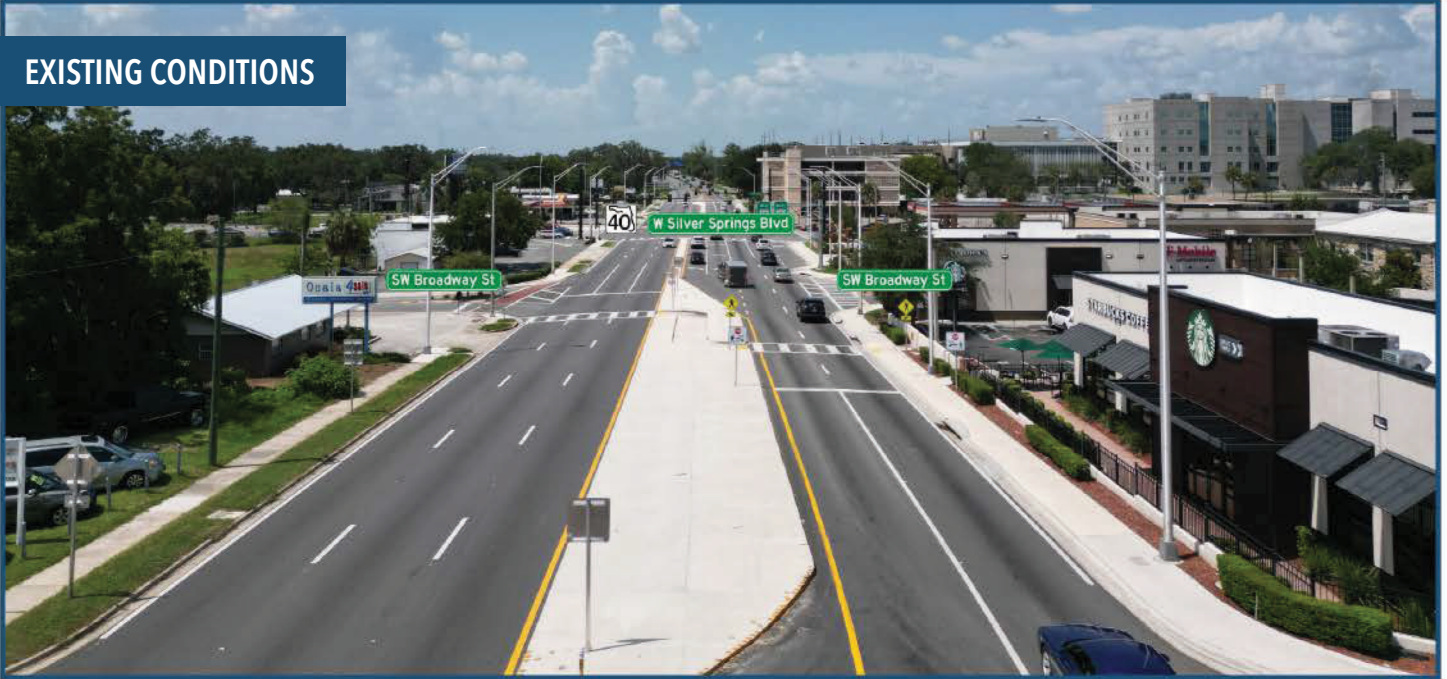
Existing conditions on the northbound South Pine Avenue approach to the intersection with West Silver Springs Boulevard.