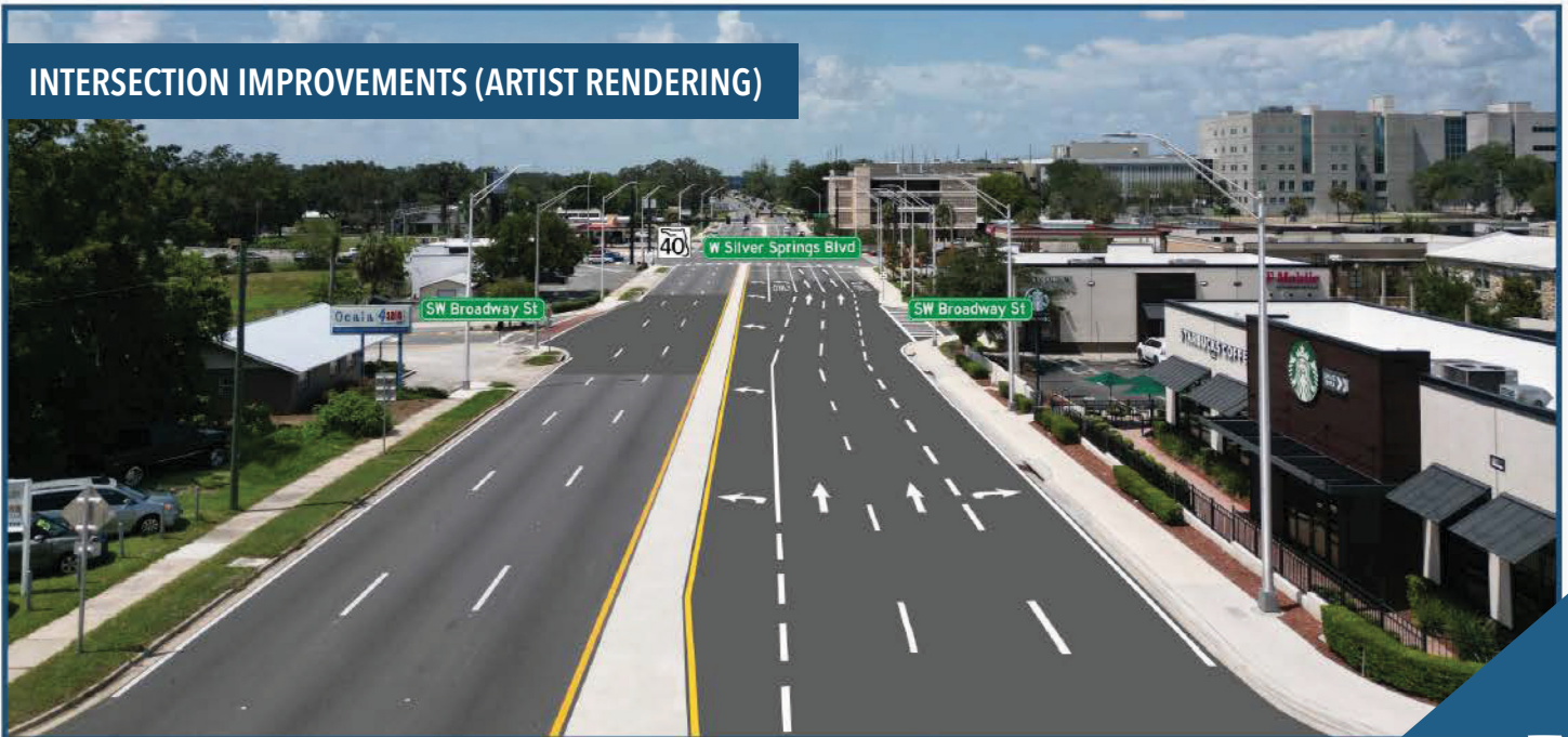
Artist rendering of the planned improvements on northbound South Pine Avenue with extensions to both the left- and right-turn lanes at the intersection