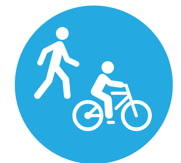
Pedestrian & Bicyclist Mobility