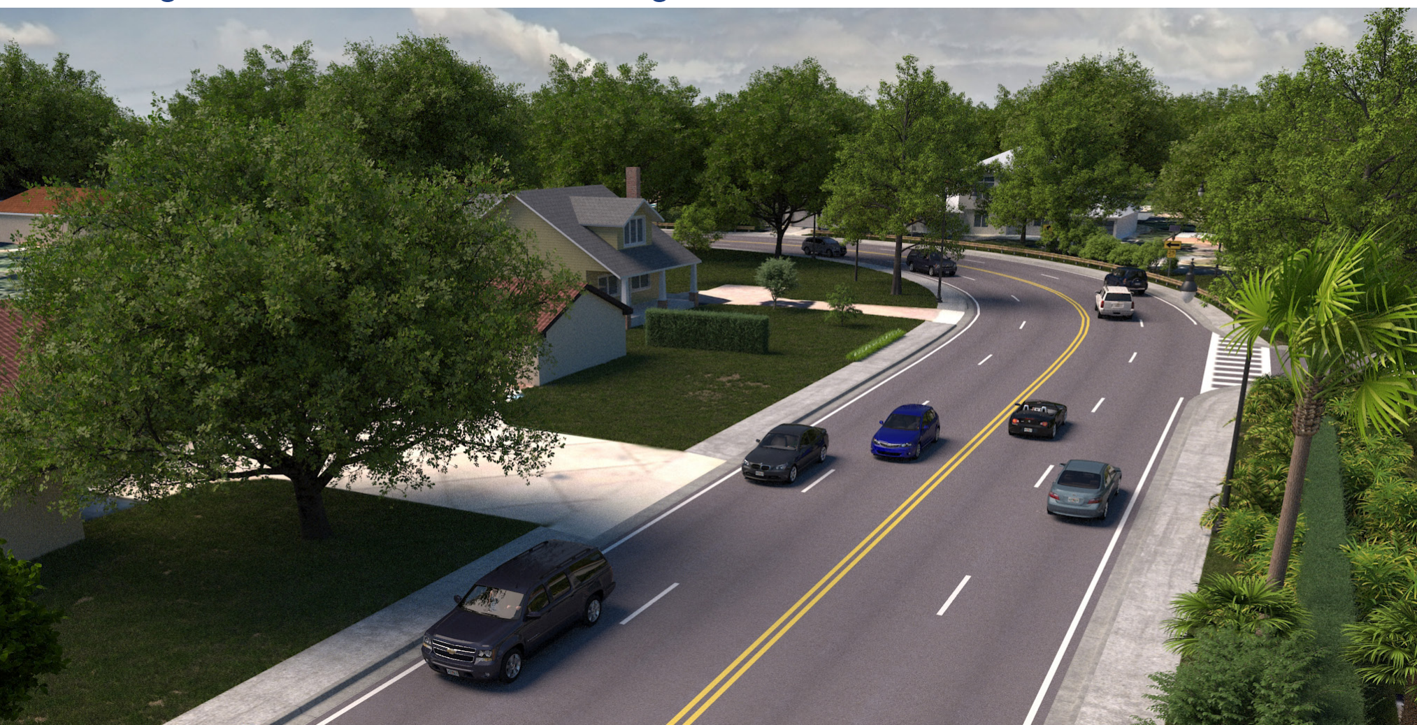
▼ Existing View of S.R. 426 Looking West at Brewer's Curve