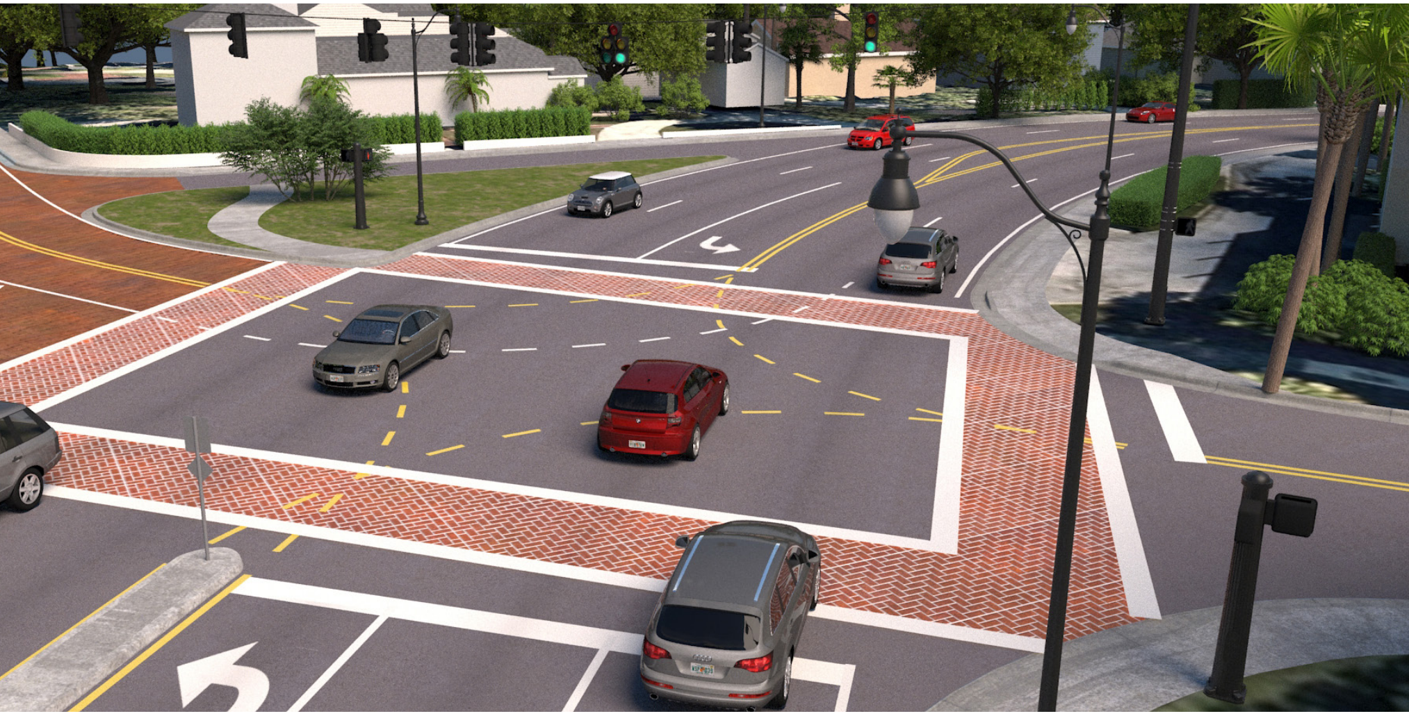
▼ Existing View of S.R. 426 Looking East at Chase Avenue / Ollie Avenue