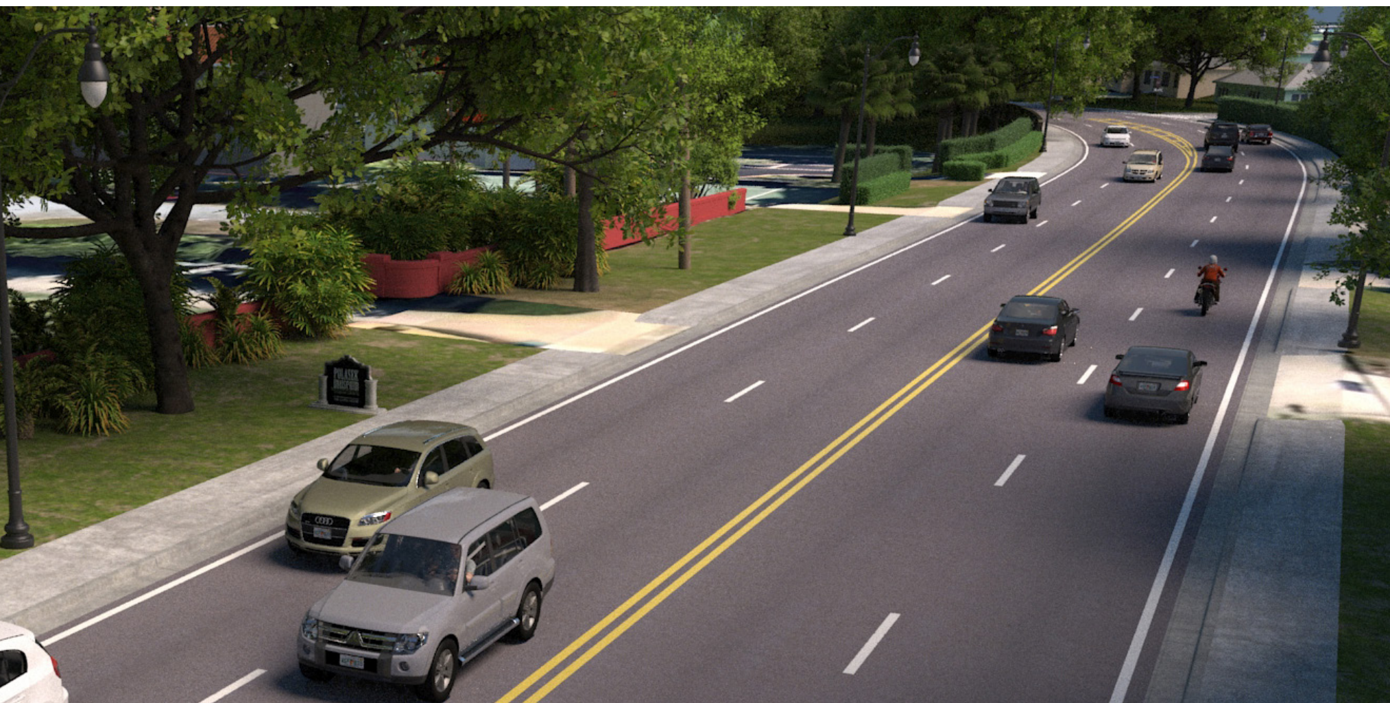
▼ Existing View of S.R. 426 Looking East from Osceola Court