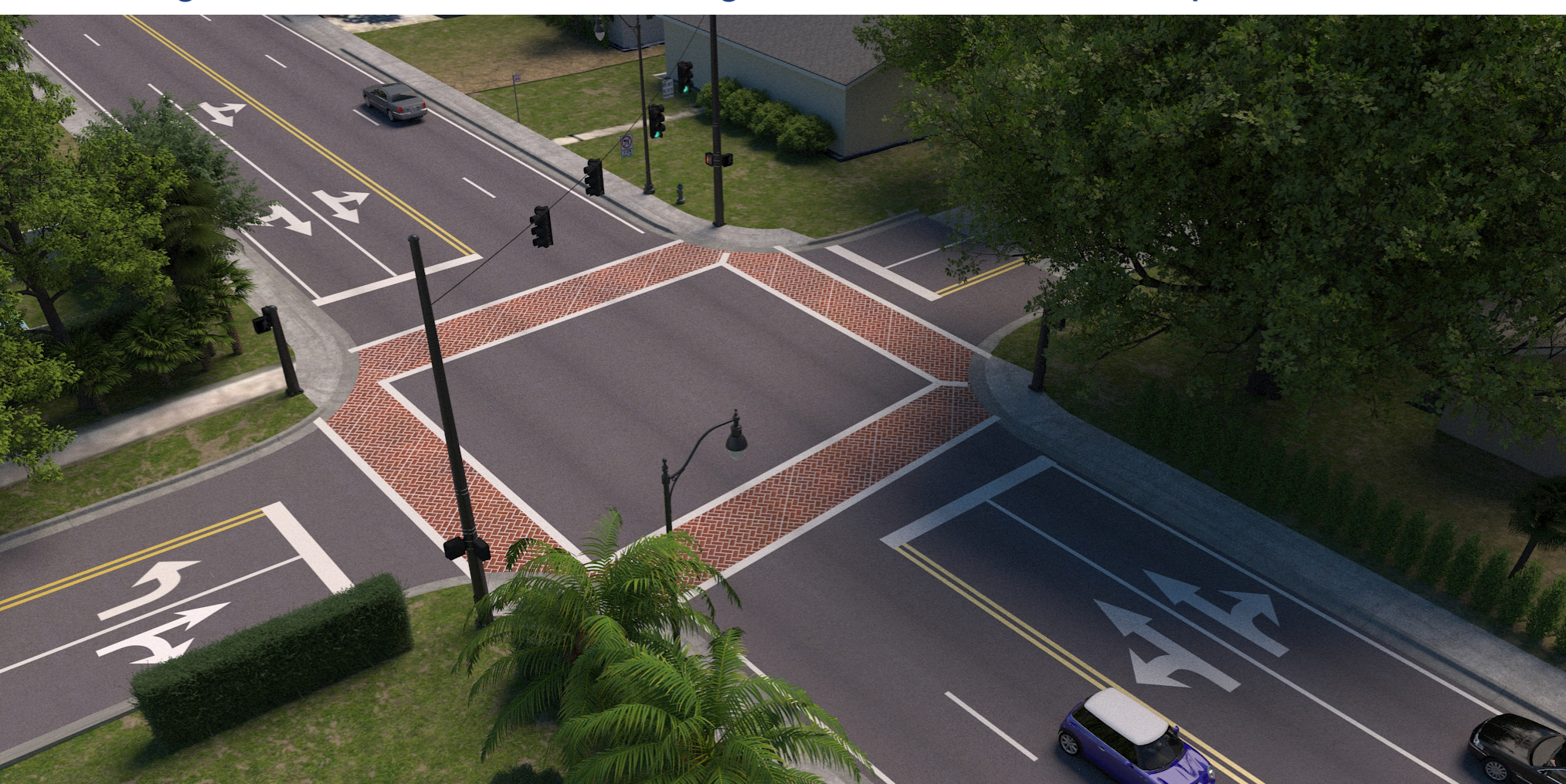
▼ Existing View of S.R. 426 Looking Southeast at N. Phelps Avenue