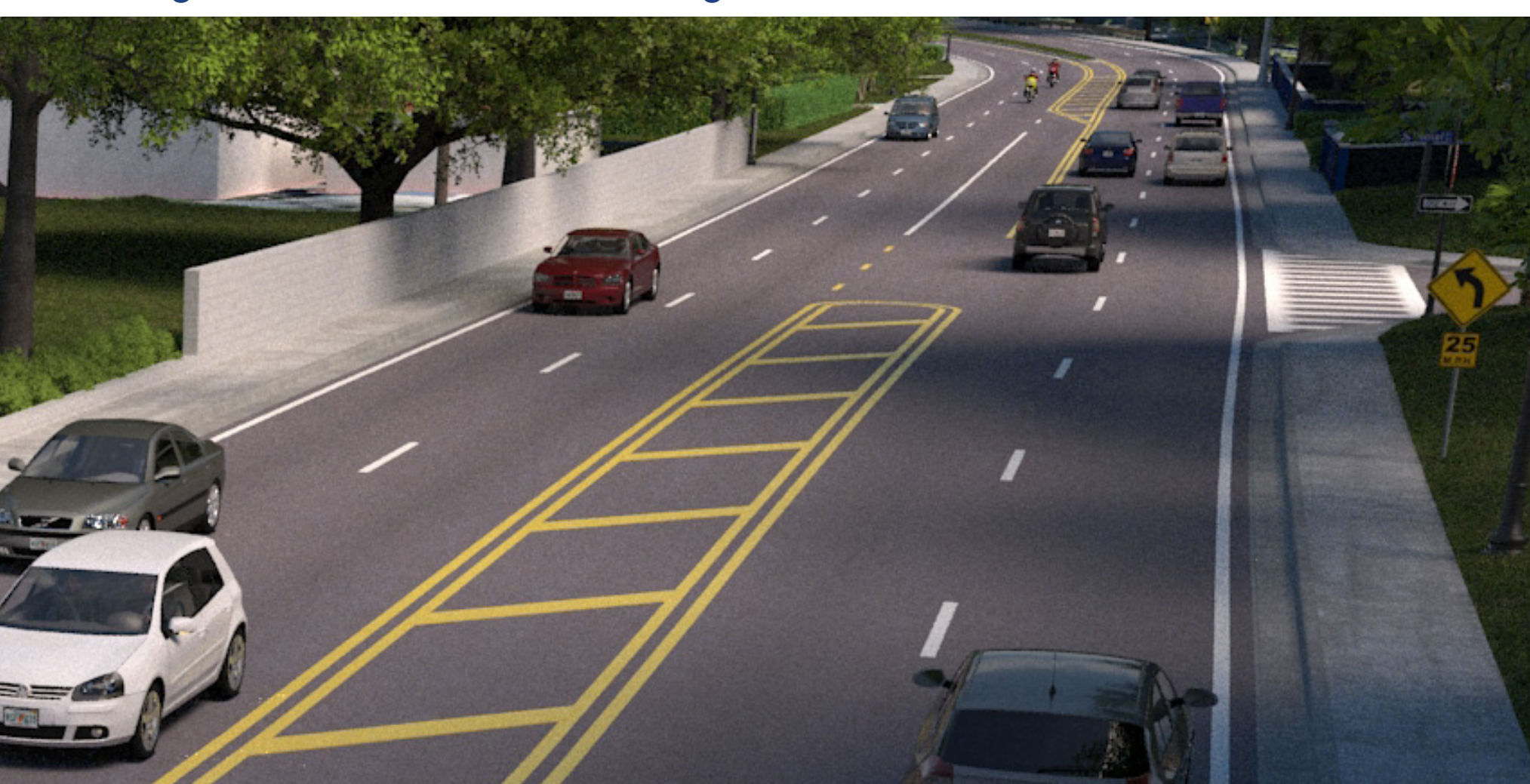
▼ Existing View of S.R. 426 Looking East from Trismen Terrace