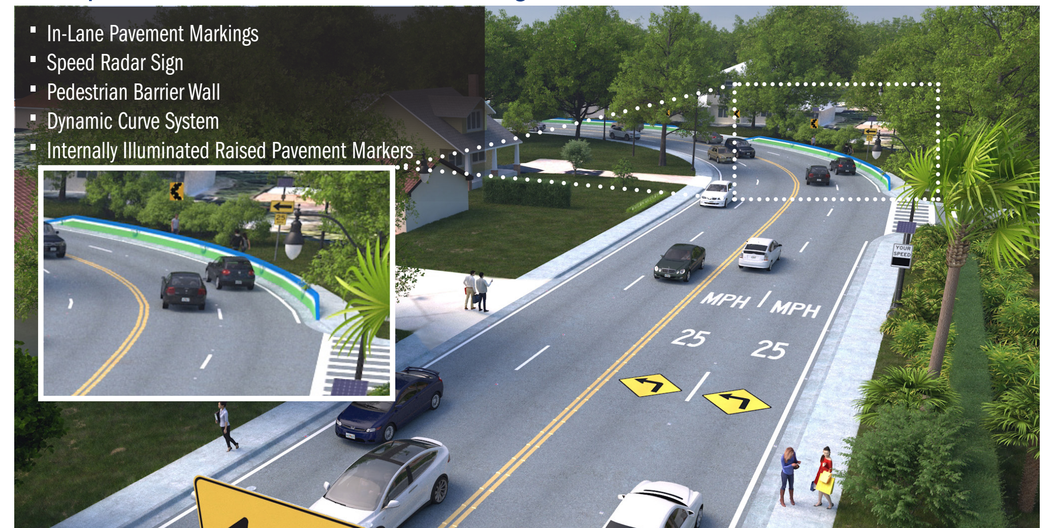
▼ Proposed View of S.R. 426 Looking West at Brewer's Curve