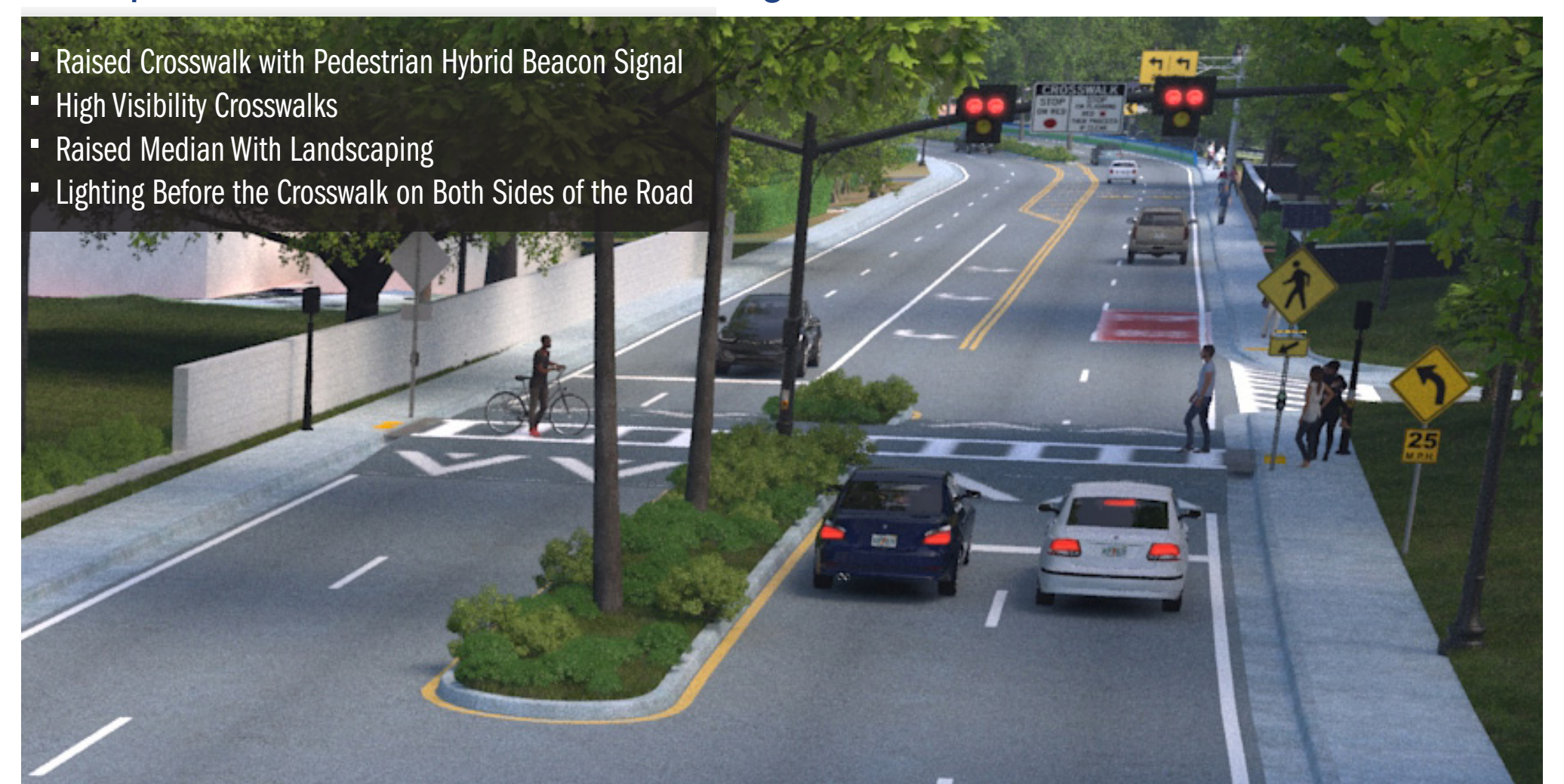
▼ Proposed View of S.R. 426 Looking East from Trismen Terrace