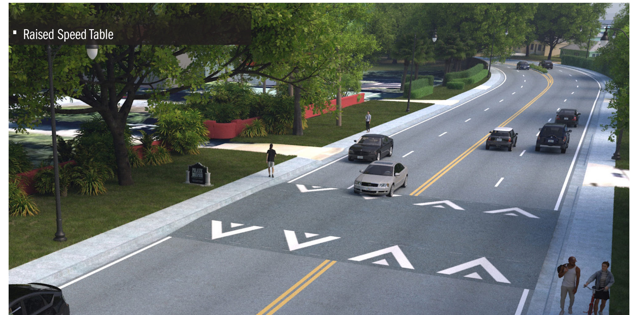
▼ Proposed View of S.R. 426 Looking East from Osceola Court