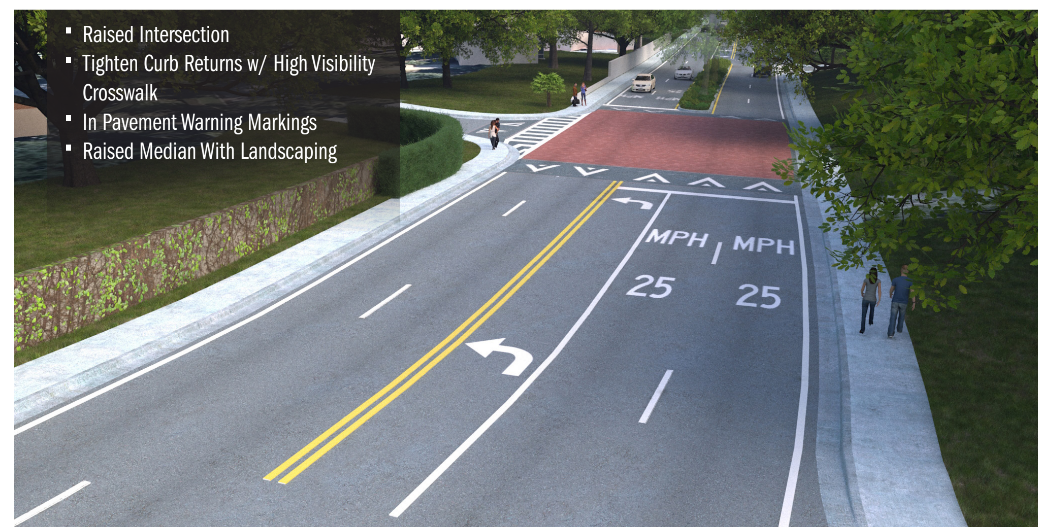
Proposed View S.R. 426 Looking East at Henkel Circle