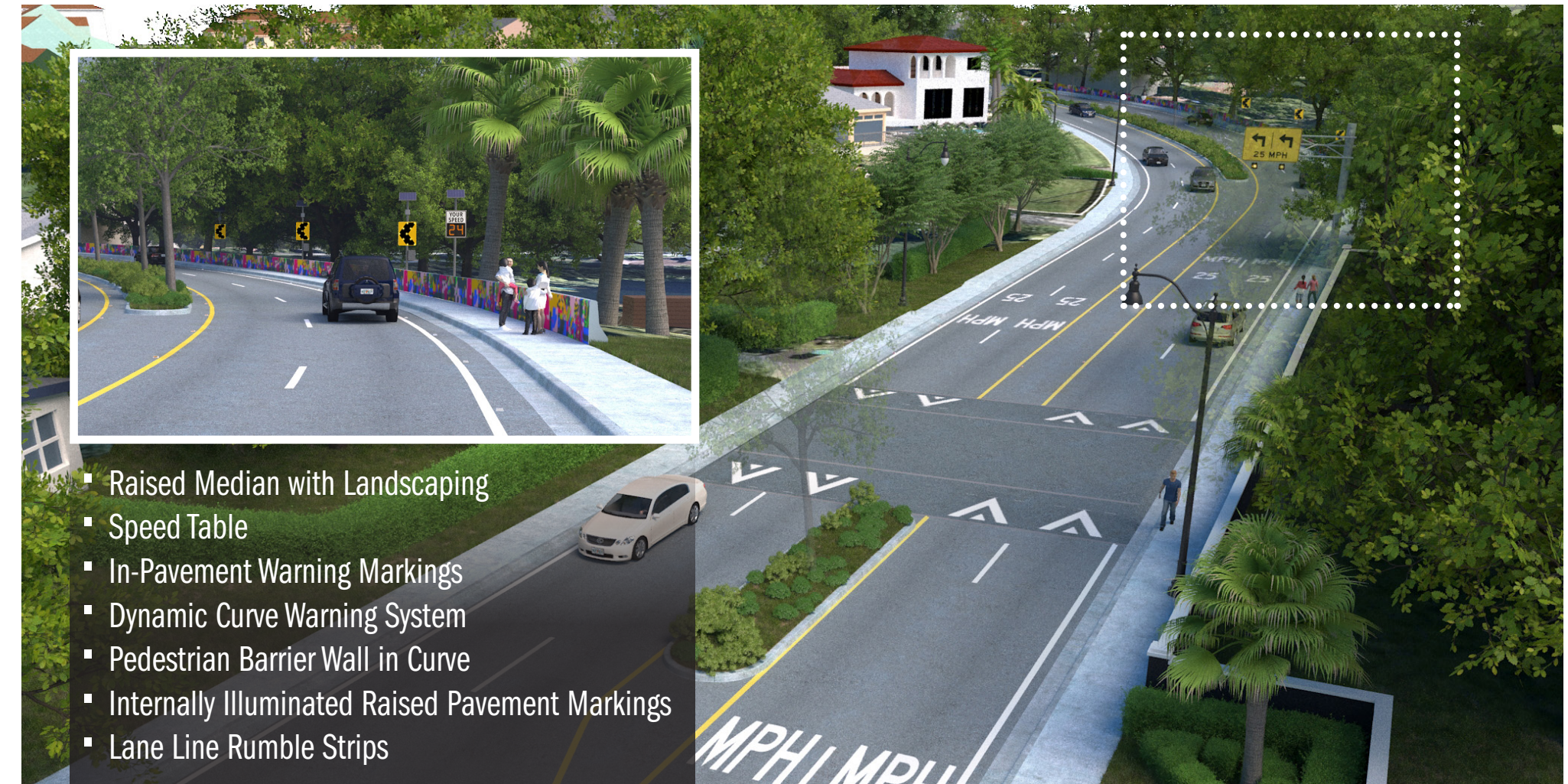
Proposed View S.R. 426 Looking East at Southern Curve