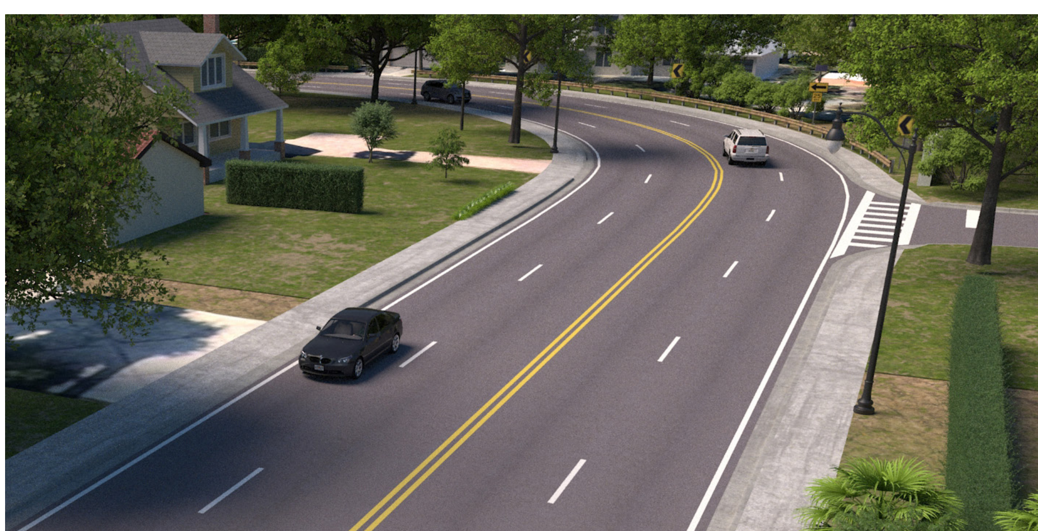
Existing View S.R. 426 Looking West at Brewers Curve