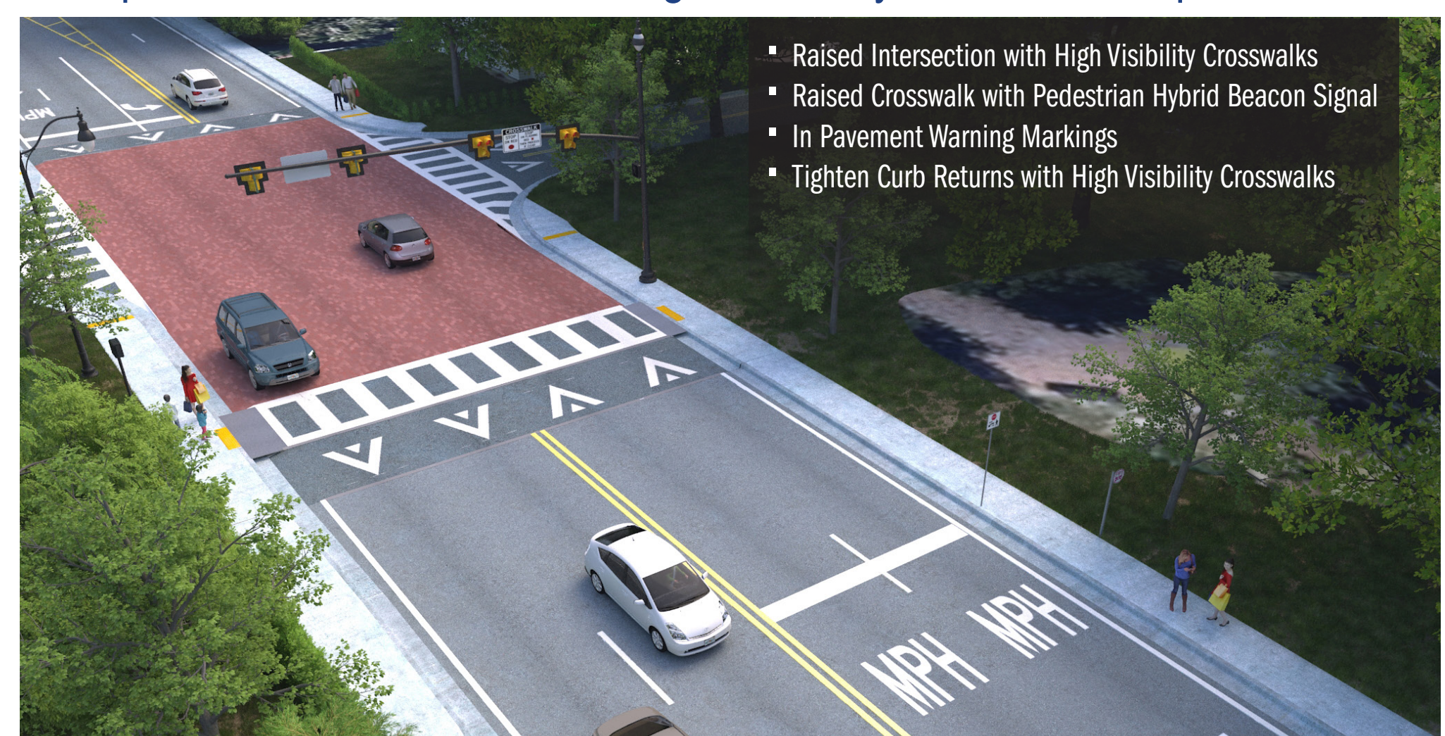
Proposed View S.R. 426 Looking East at Sylvan Drive/Shepherd Avenue