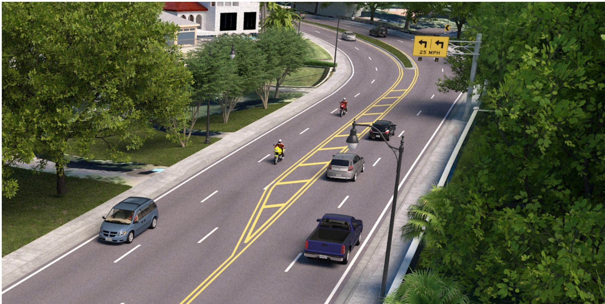
Existing View S.R. 426 Looking East at Southern Curve