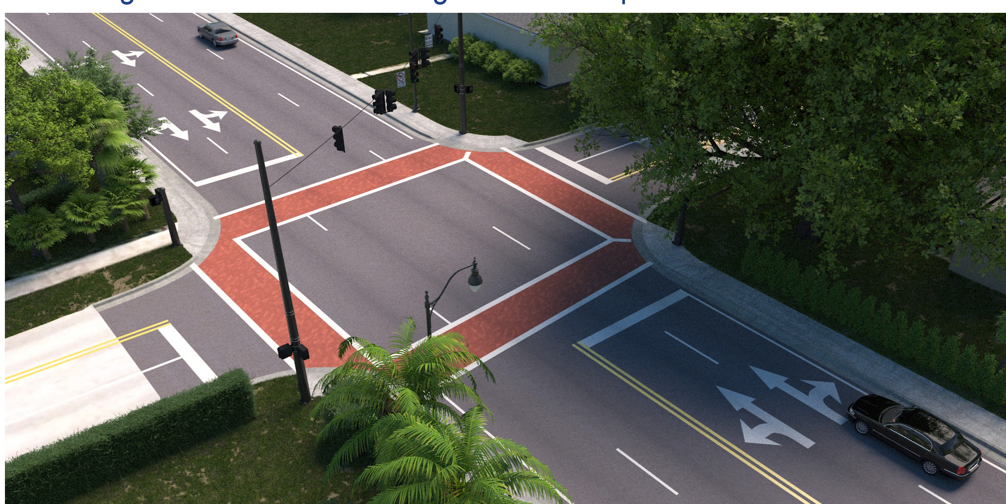
Existing View S.R. 426 Looking East at Phelps Avenue