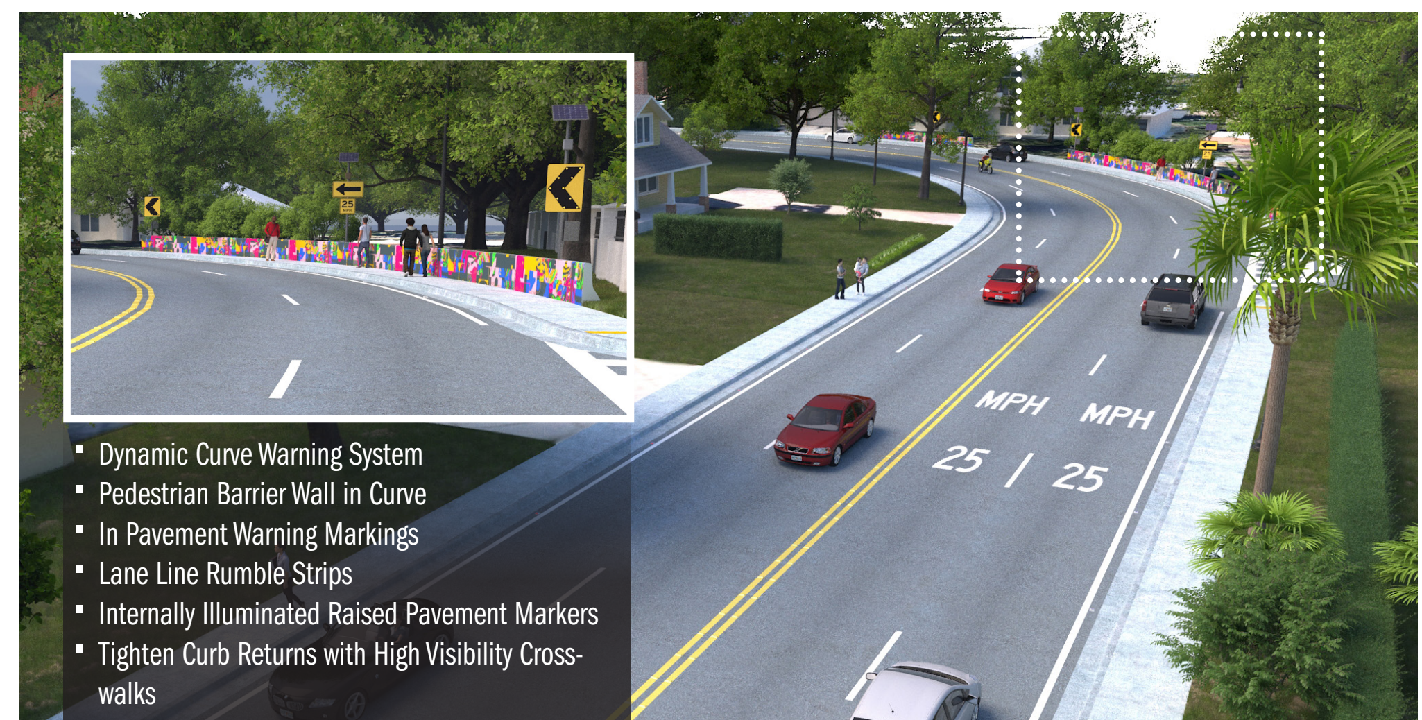
Proposed View S.R. 426 Looking West at Brewers Curve