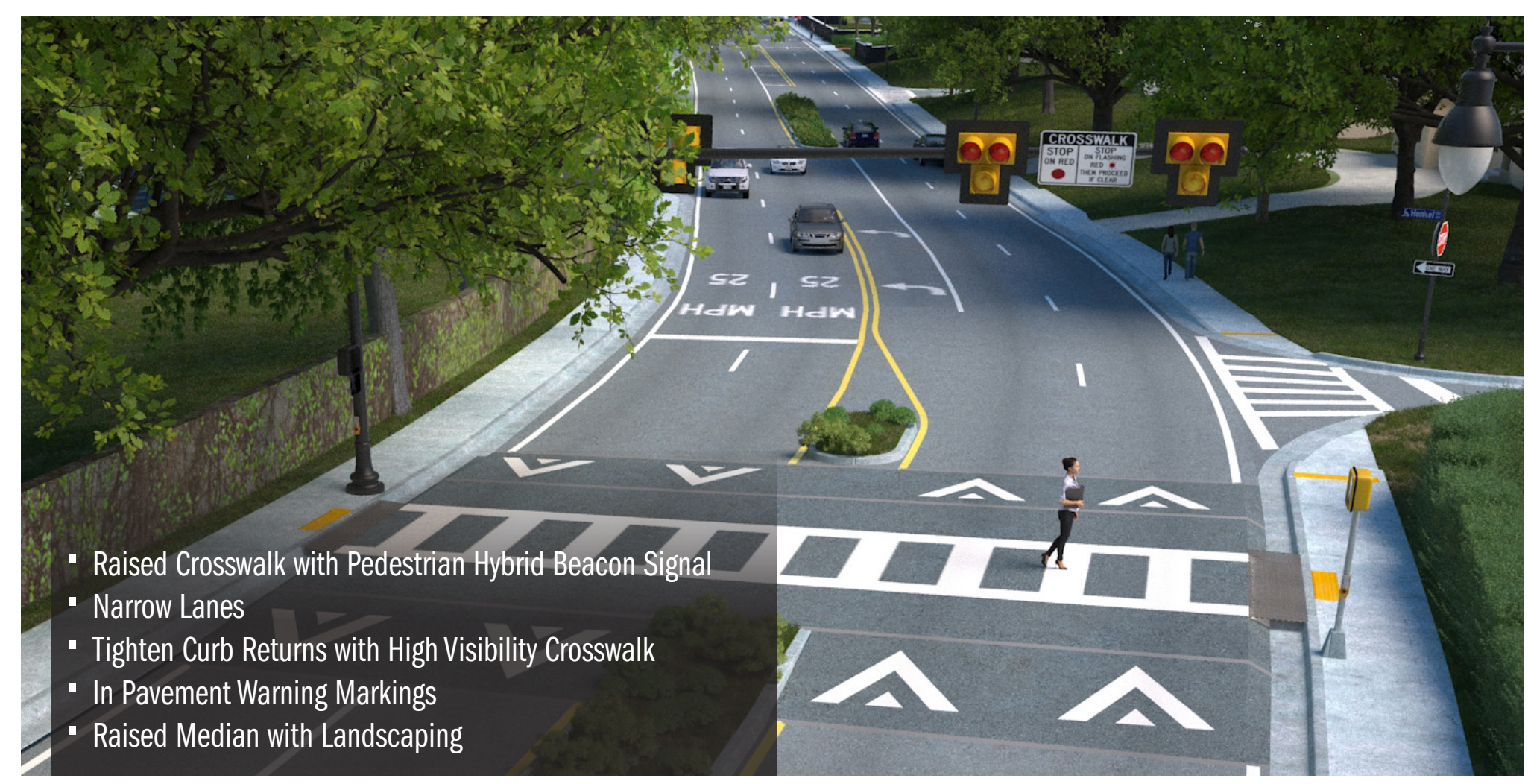
Proposed View S.R. 426 Looking East at Henkel Circle