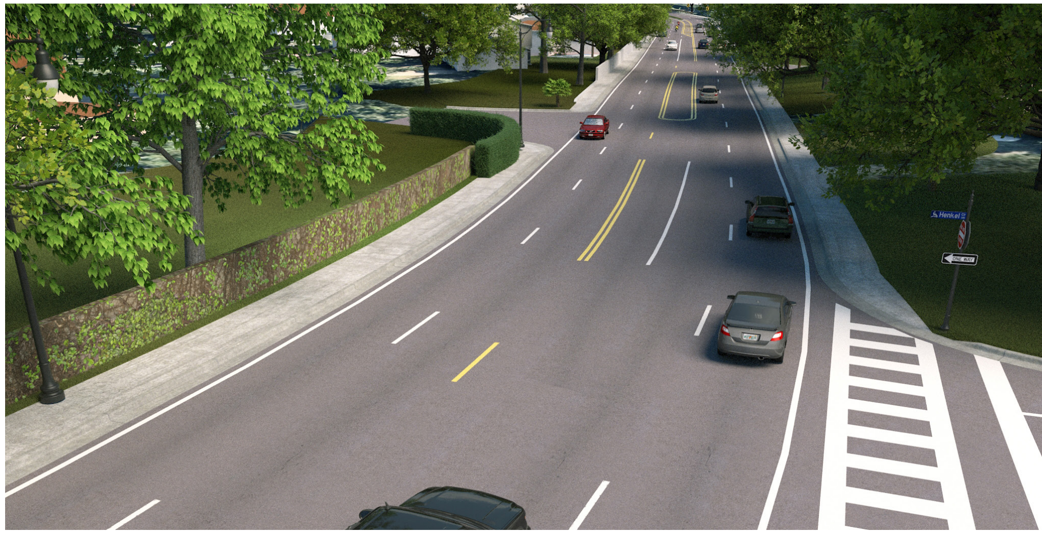
Existing View S.R. 426 Looking East at Henkel Circle