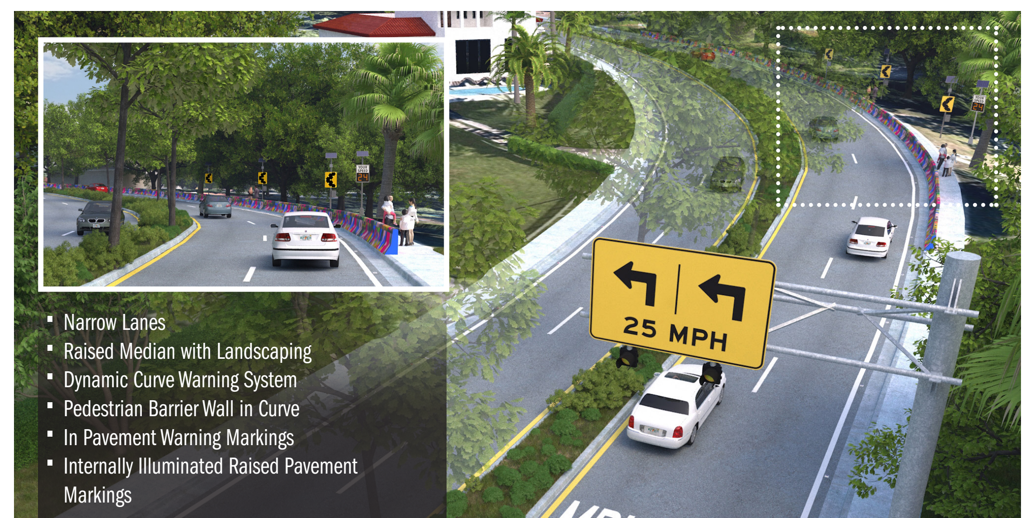
Proposed View S.R. 426 Looking East at Southern Curve