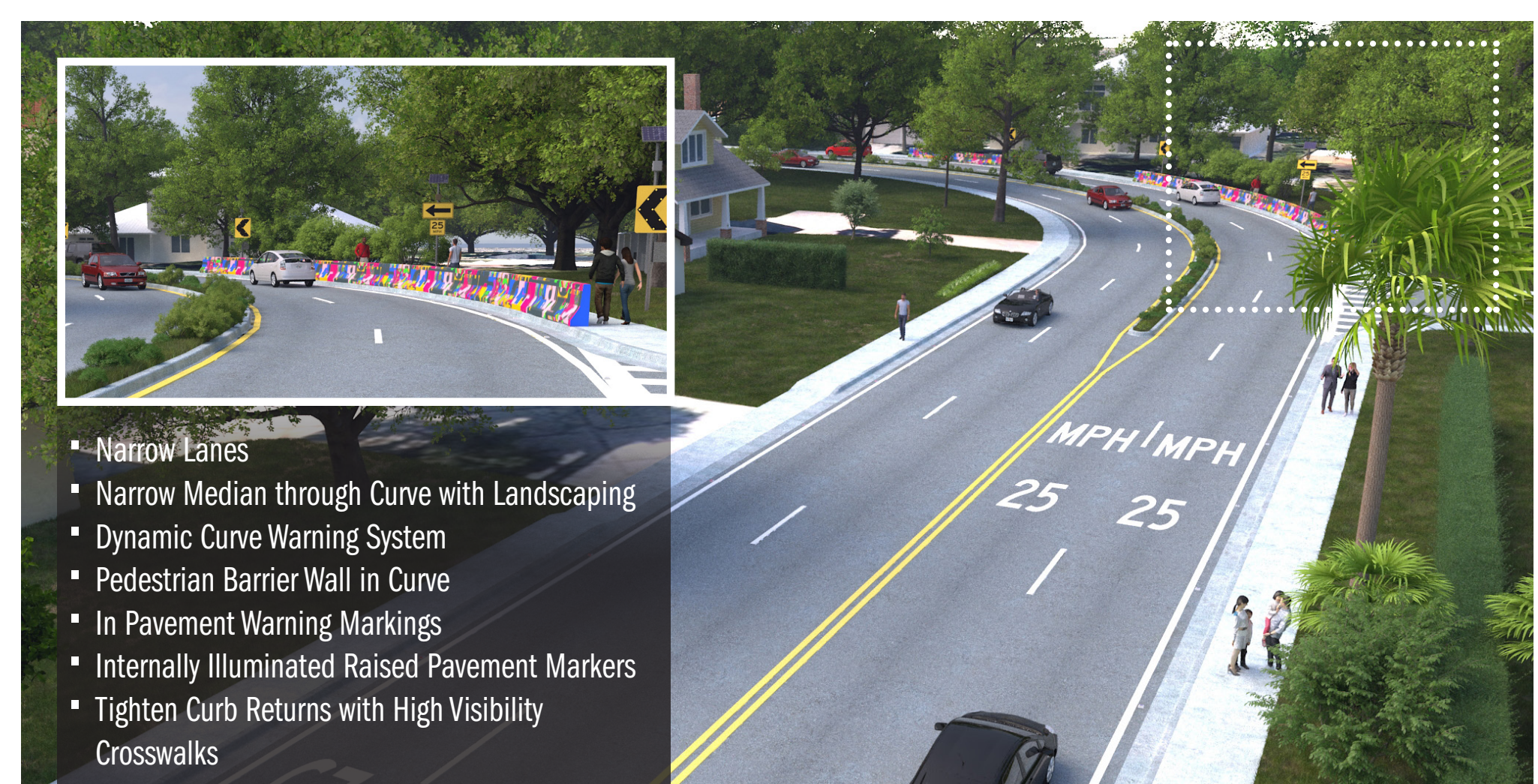
Proposed View S.R. 426 Looking West at Brewers Curve