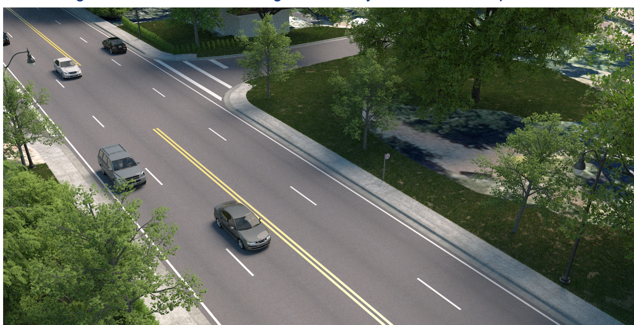
Existing View S.R. 426 Looking East at Sylvan Drive/Shepherd Avenue