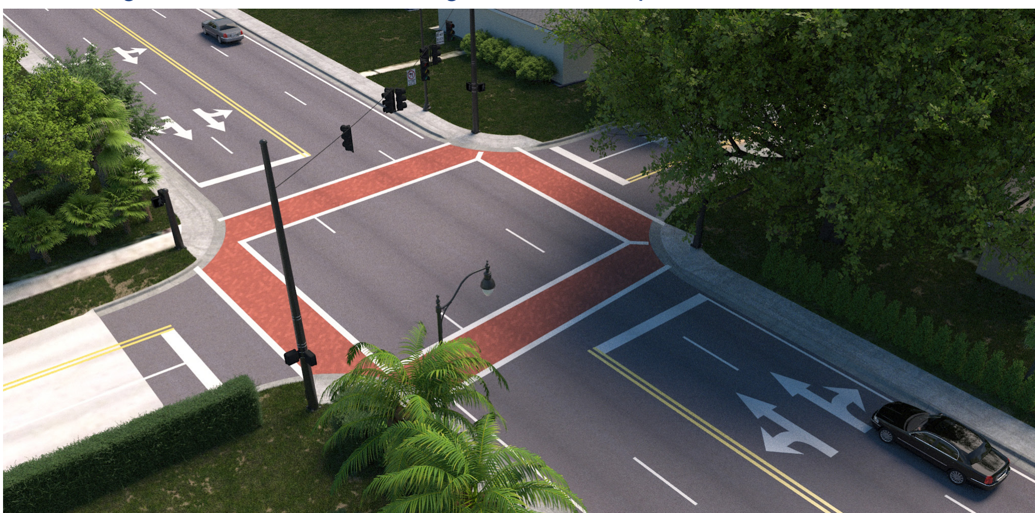
Existing View S.R. 426 Looking East at Phelps Avenue