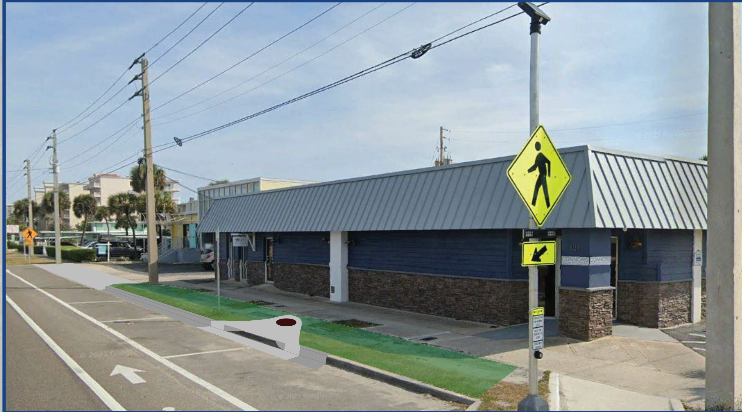
Example of Drainage Improvements at 1 st St. N. (Northbound)