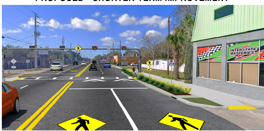
(*) Improvement shown graphically within proposed rendering