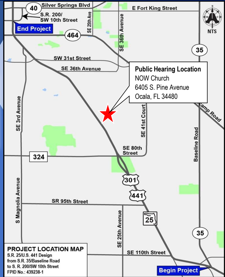
PROJECT LOCATION MAP S.R. 25/U.S. 441 Design from S.R. 35/Baseline Road to S. R. 200/SW 10th Street FPID No.: 439238-1