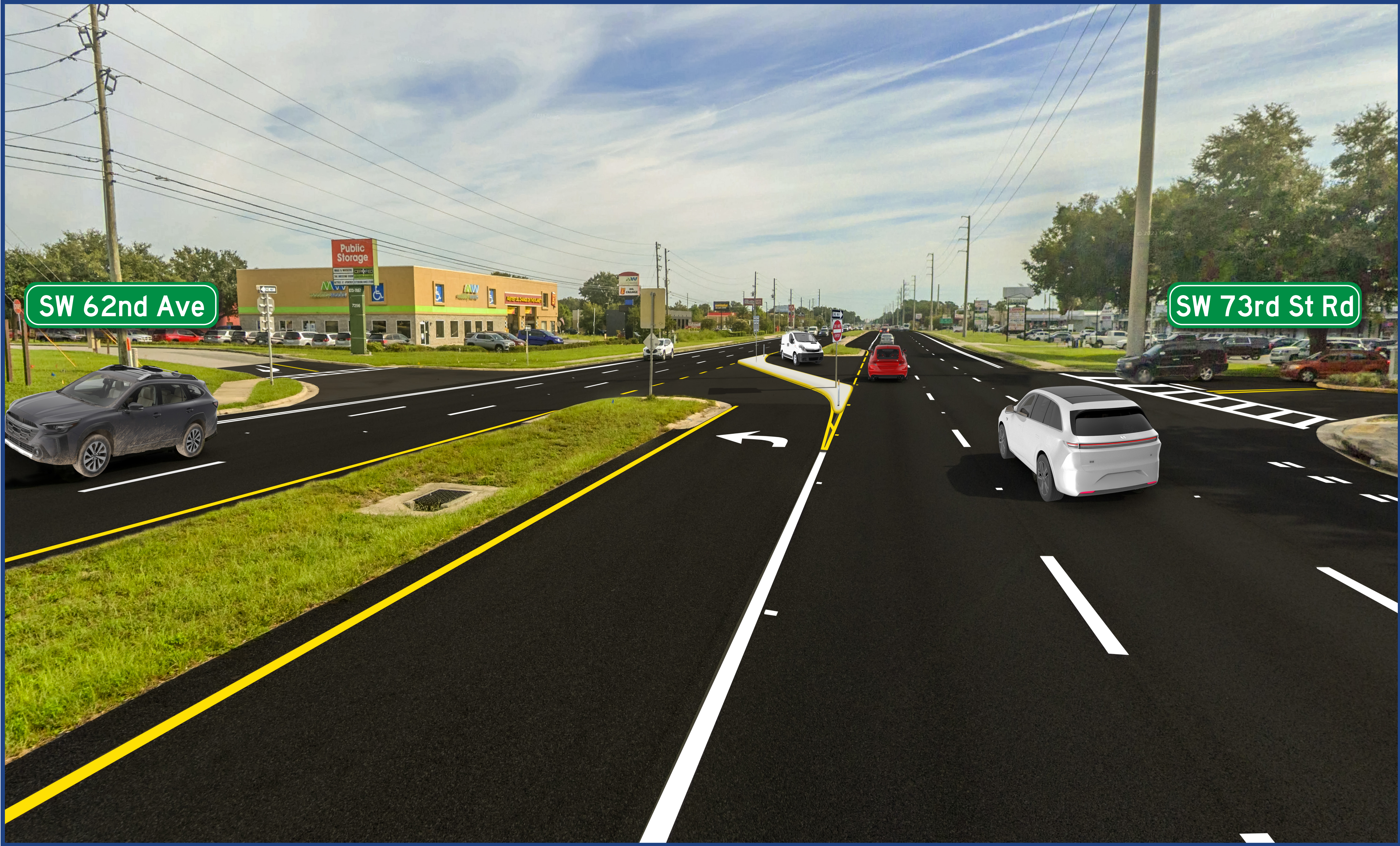
Artist Rendering: View from Eastbound S.R. 200

Stay up to date with project information by scanning the QR code to visit the project website