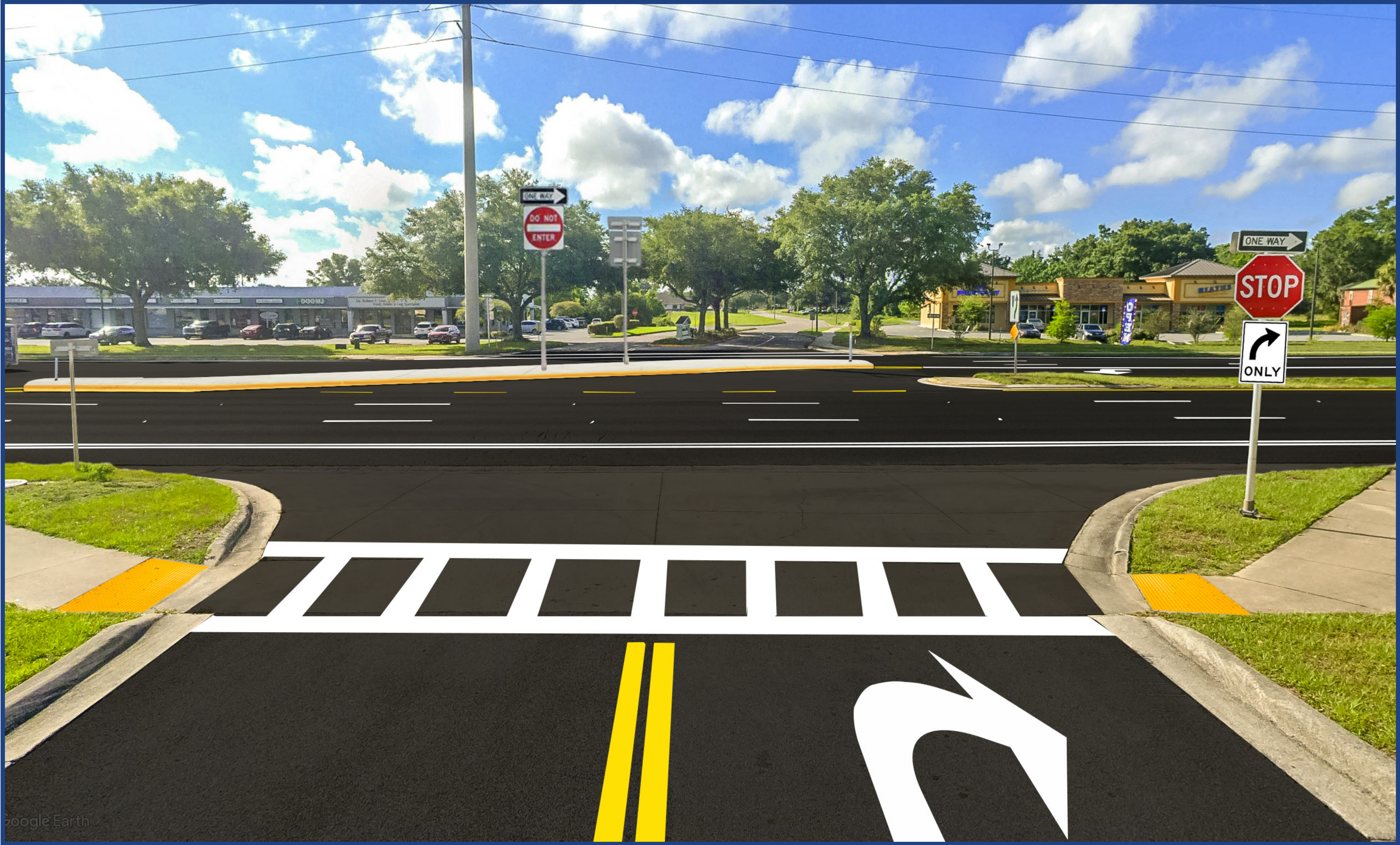
Artist Rendering: View from Southbound SW 62nd Avenue

Stay up to date with project information by scanning the QR code to visit the project website