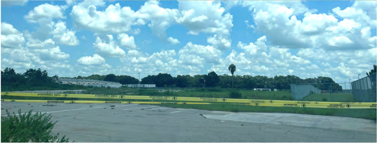
Site 14 – Boutwell Limerock Mining