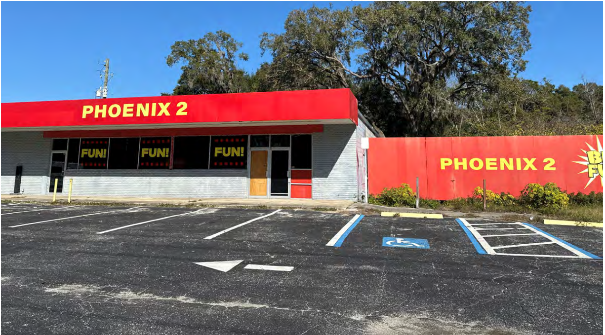
Site 51 – Ashley Farms Golf & Country Club WTP