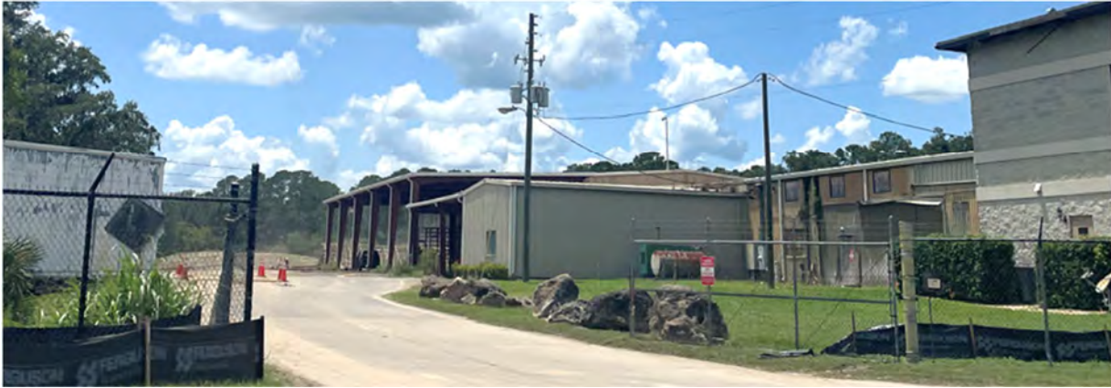
Site 9 – Thermo King of Ocala, Inc.