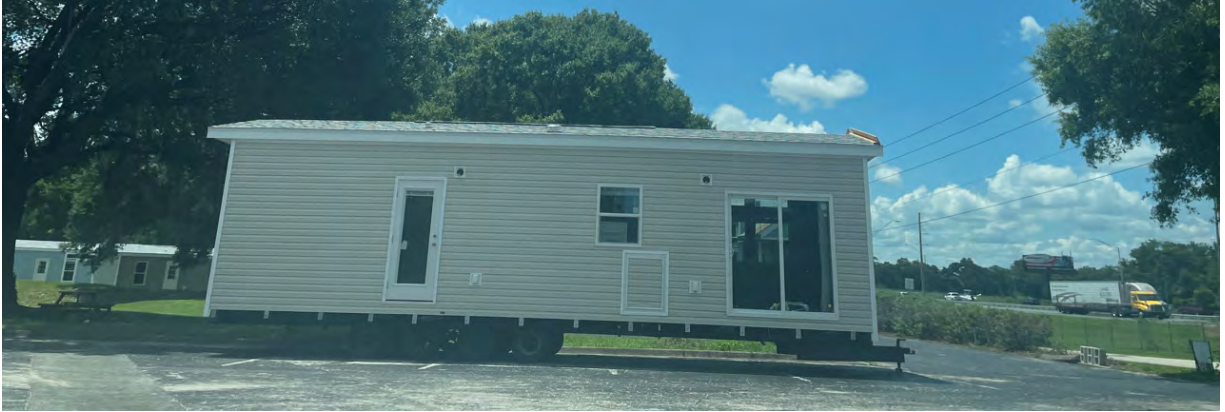
Site 30 – Famar Manufacturing Inc.