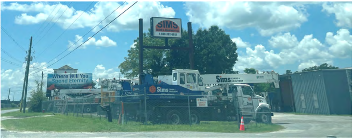
Site 29 – Chariot Eagle