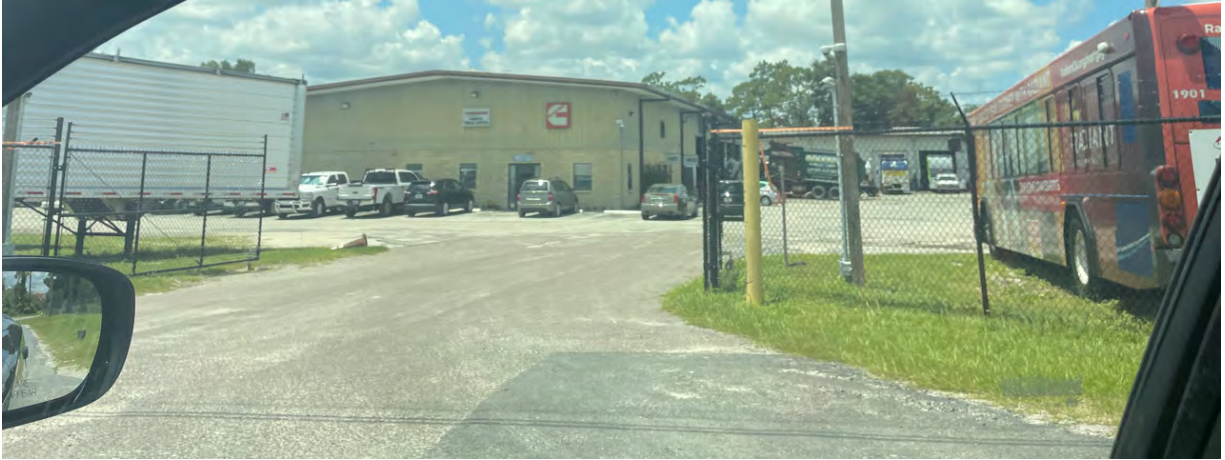
Site 25 – Bennetts Diesel