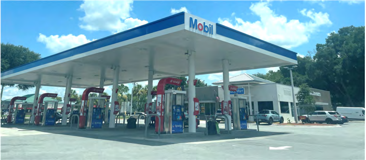
Site 6 – Shamrock Station