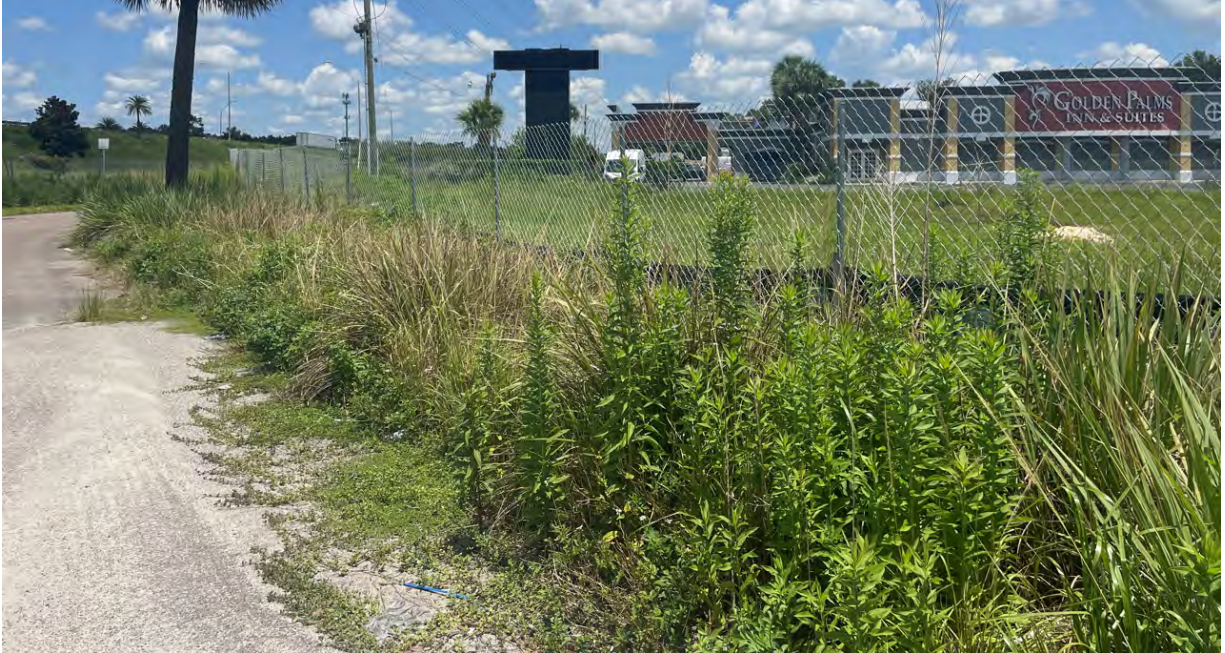
Site 21 – Fuqua Sawmill