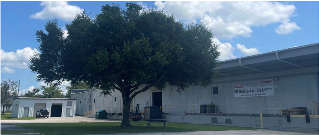
Site 41 – E-ONE