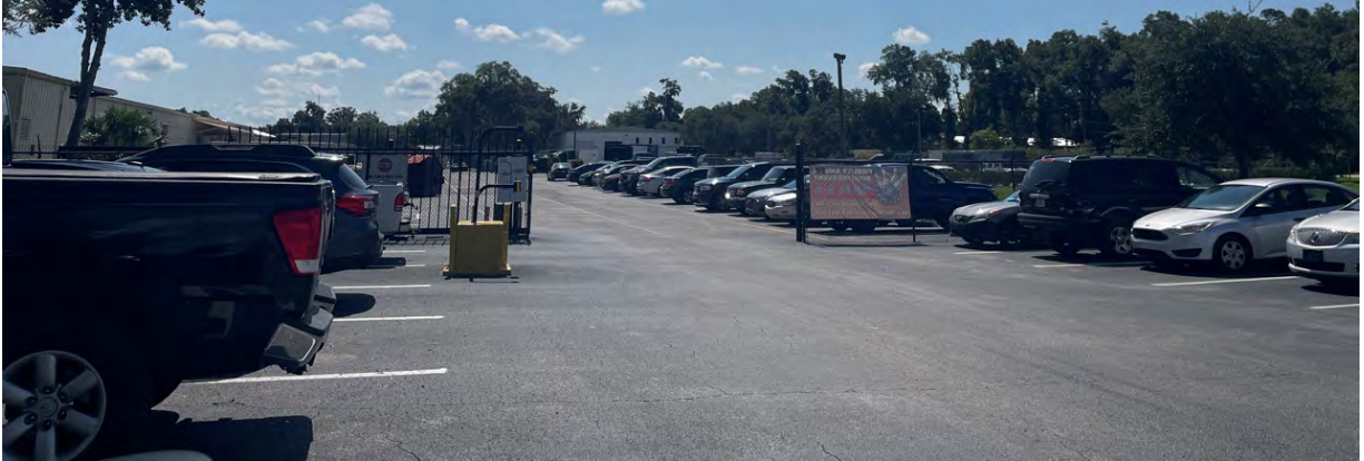
Site 40 – Elster Amco Water Inc.