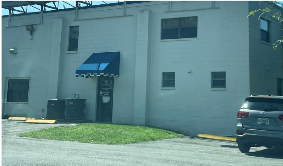
Site 39 – Fidelity Manufacturing