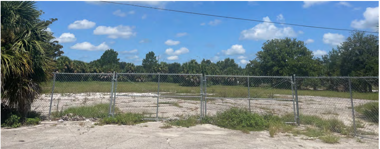
Site 35 - Amoco-Colony #106 / Exxon on Run Ocala