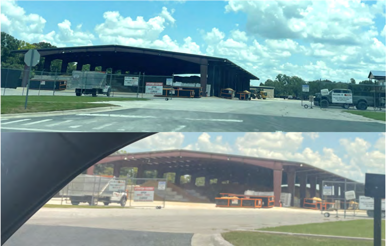
Site 11 – Scorpion Performance