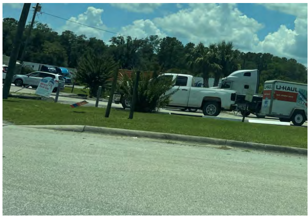
Site 2 – Pilot Travel Center #092