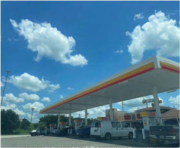
Site 1 – Shell-Gators #184