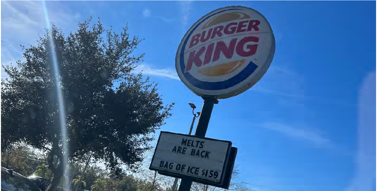
Site 49 – Chevron-Blitchton Road