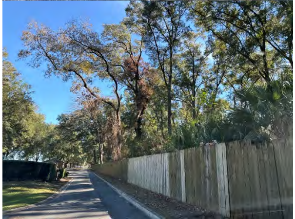
B11-C & B12-C & B13-A Combined*