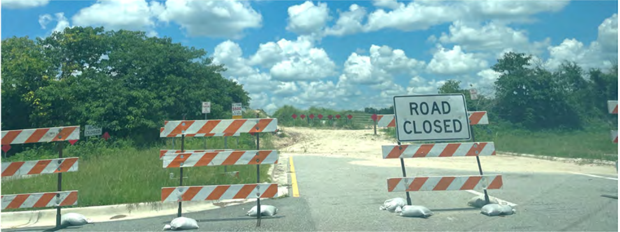
Site 16 – Counts Landfill