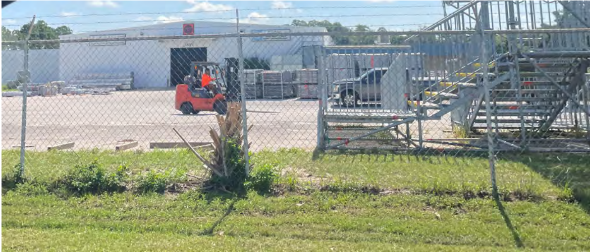
Site 44 – Jayveer Qwik King Stores