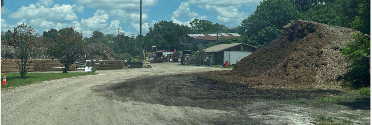
Site 22 – Ron's Towing / Marathon-Blitchton #346