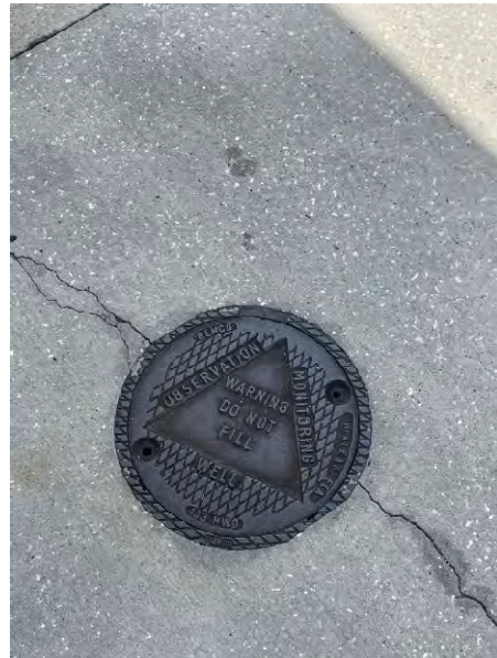
Site 24 – Raney Truck Parts