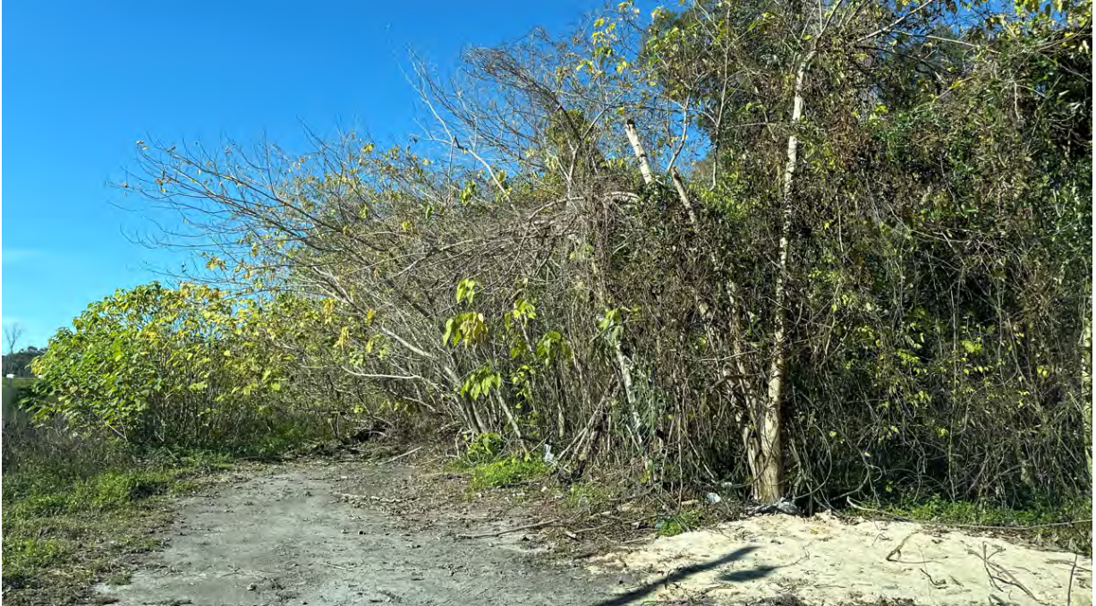
B1-D & B2-D Combined