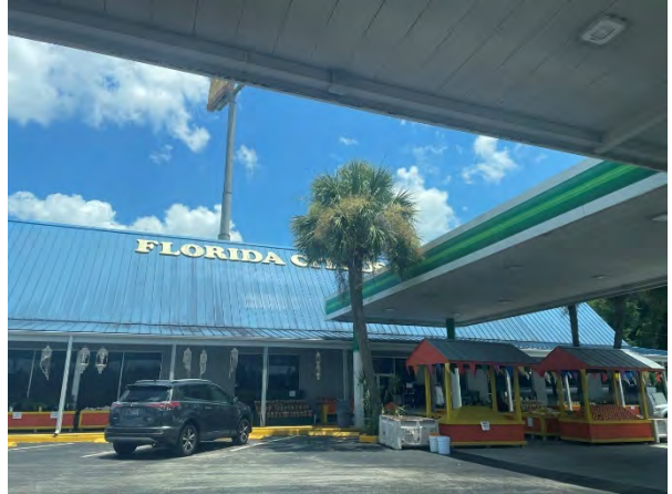
Site 5 – Pantry Inc. / FL #0160