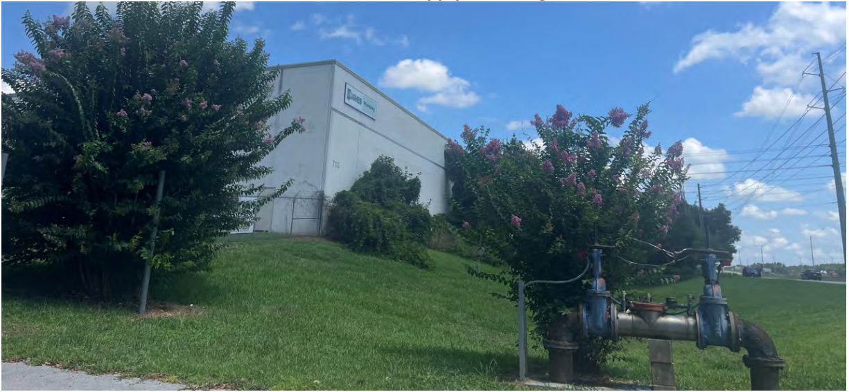
Site 38 – POA Acquisitions