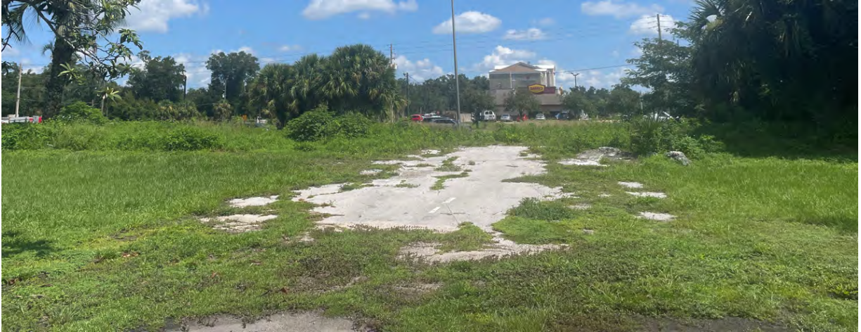
Site 34 – Island Food Store #409