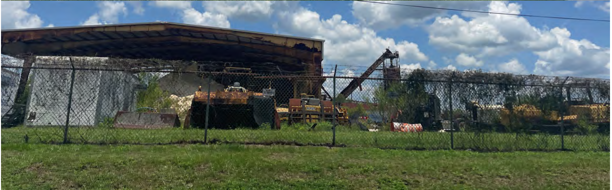
Site 18 – Sunshine Mart #201