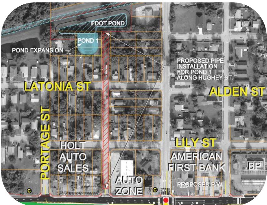
Proposed pipe installation for Pond 1 along Hughey Street from SR 600 (John Young Parkway) to Pond 1.