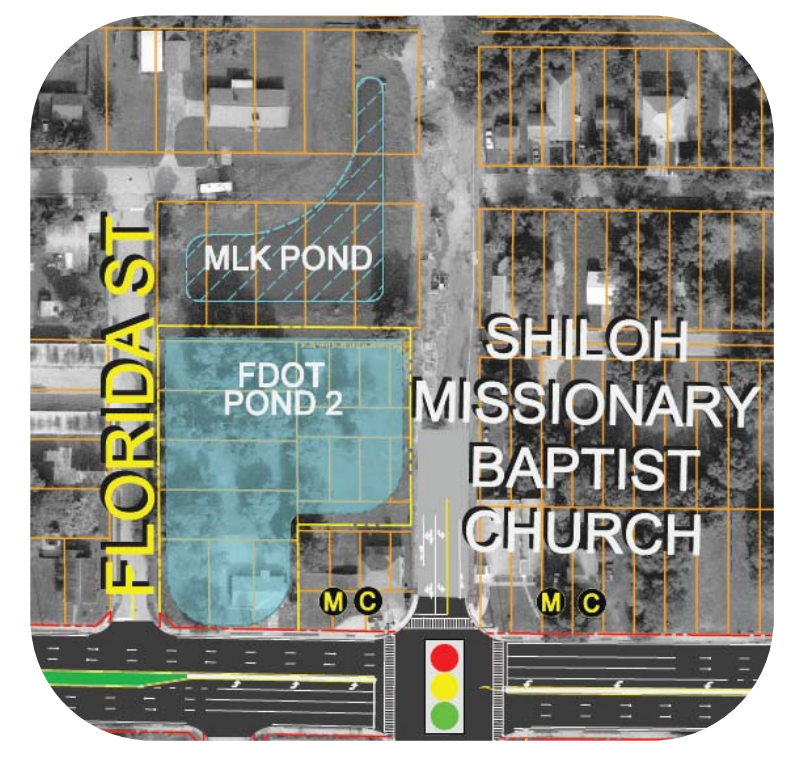
Redesigned FDOT Pond 2 in order to have FDOT Pond 2 separate from City's Pond (MLK Pond).