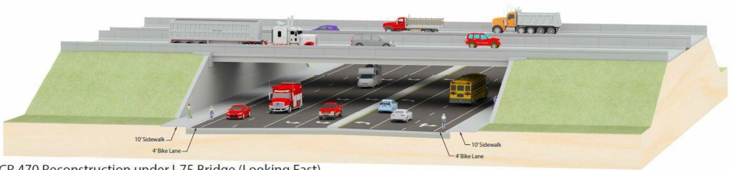
CR 470 Reconstruction under I-75 Bridge (Looking East)