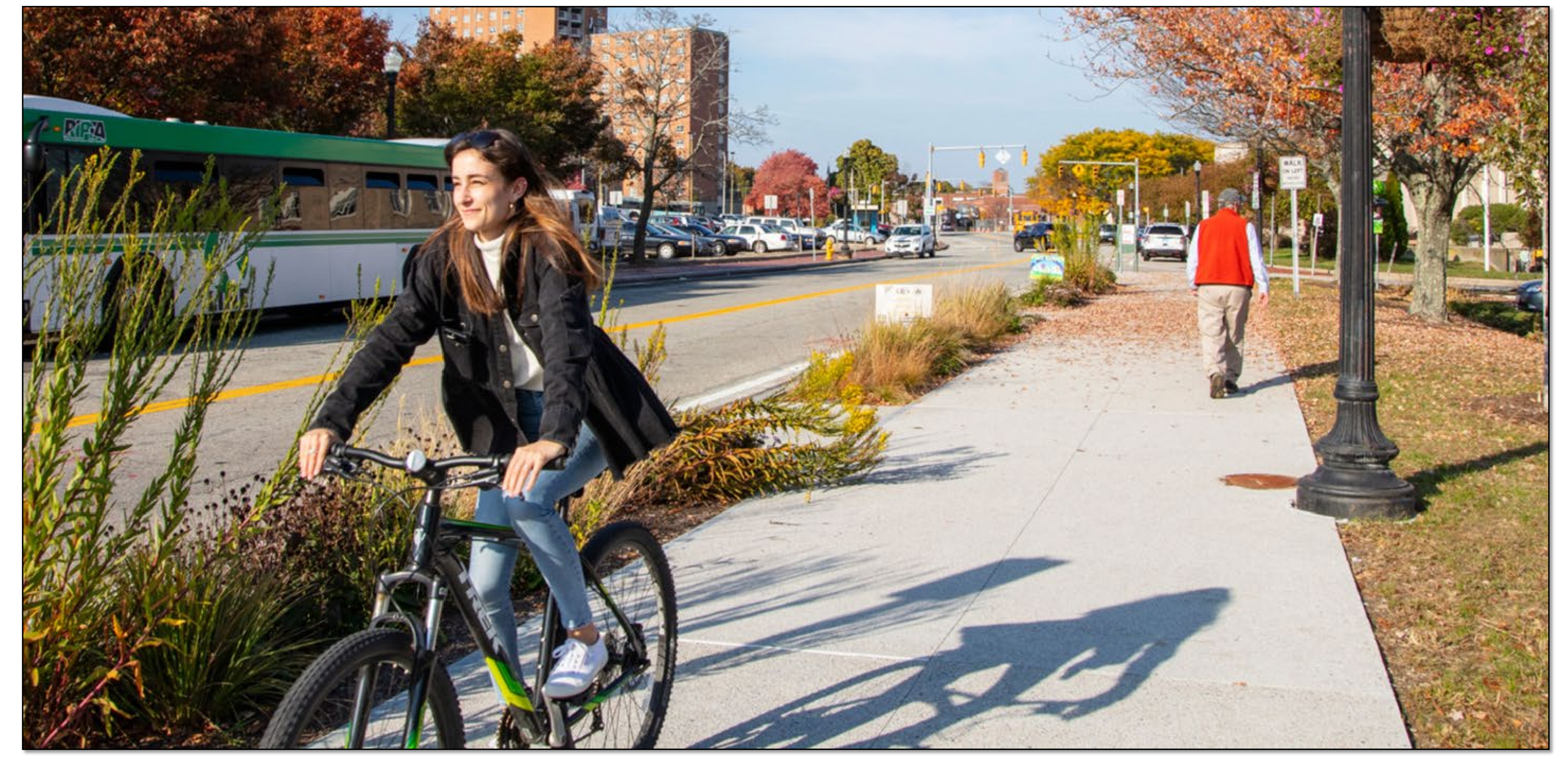
Separated Shared Use Paths and Sidewalks