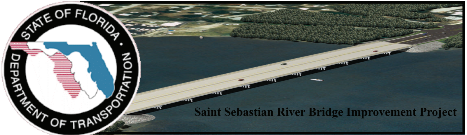
Saint Sebastian River Bridge Improvement Project