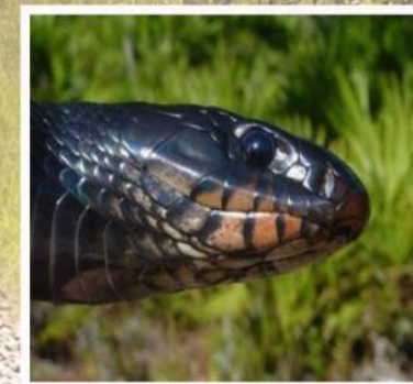
Eastern Indigo Snake