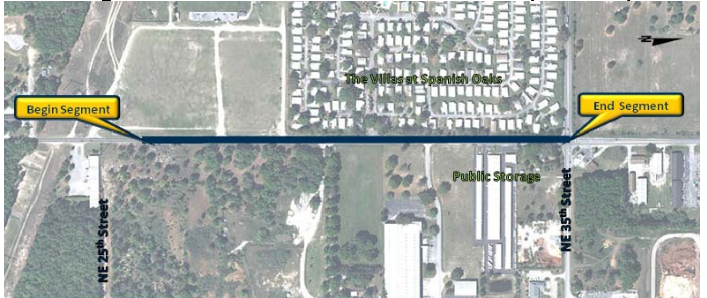
There are no changes in this segment. Improvements at the intersection with NE 35<sup>th</sup> Street will match with Marion County's design plans to widen NE 35<sup>th</sup> Street in this area. The next project phases (right-of-way acquisition and construction) are not funded.