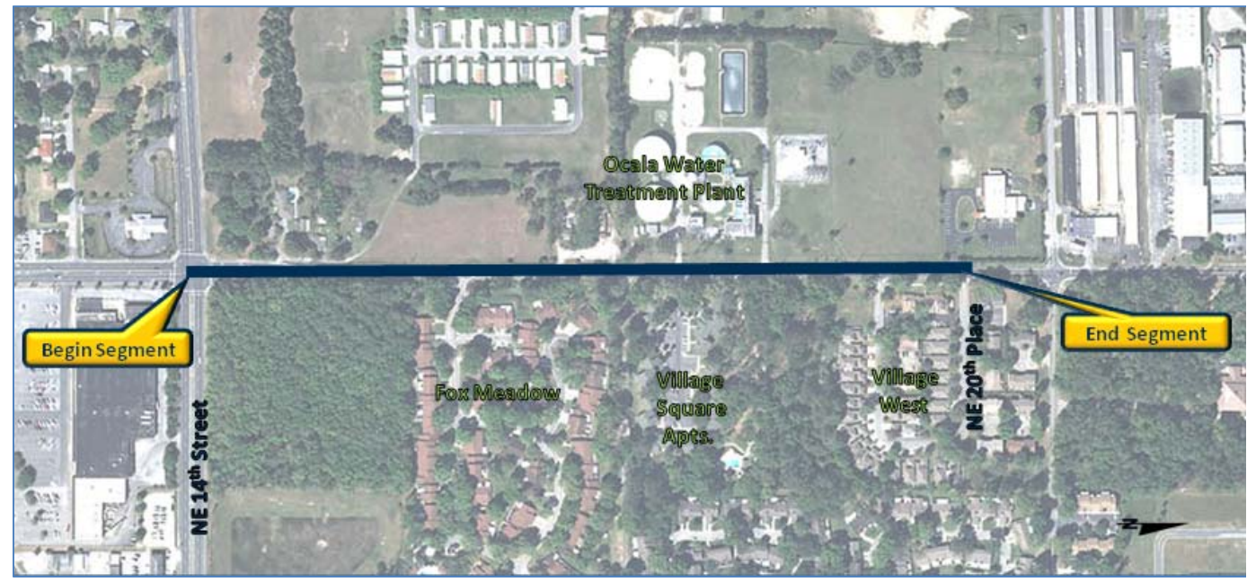
There is less than a seven-foot shift to the east in the segment's middle and north end. The next project phases (right-of-way acquisition and construction) are not funded.