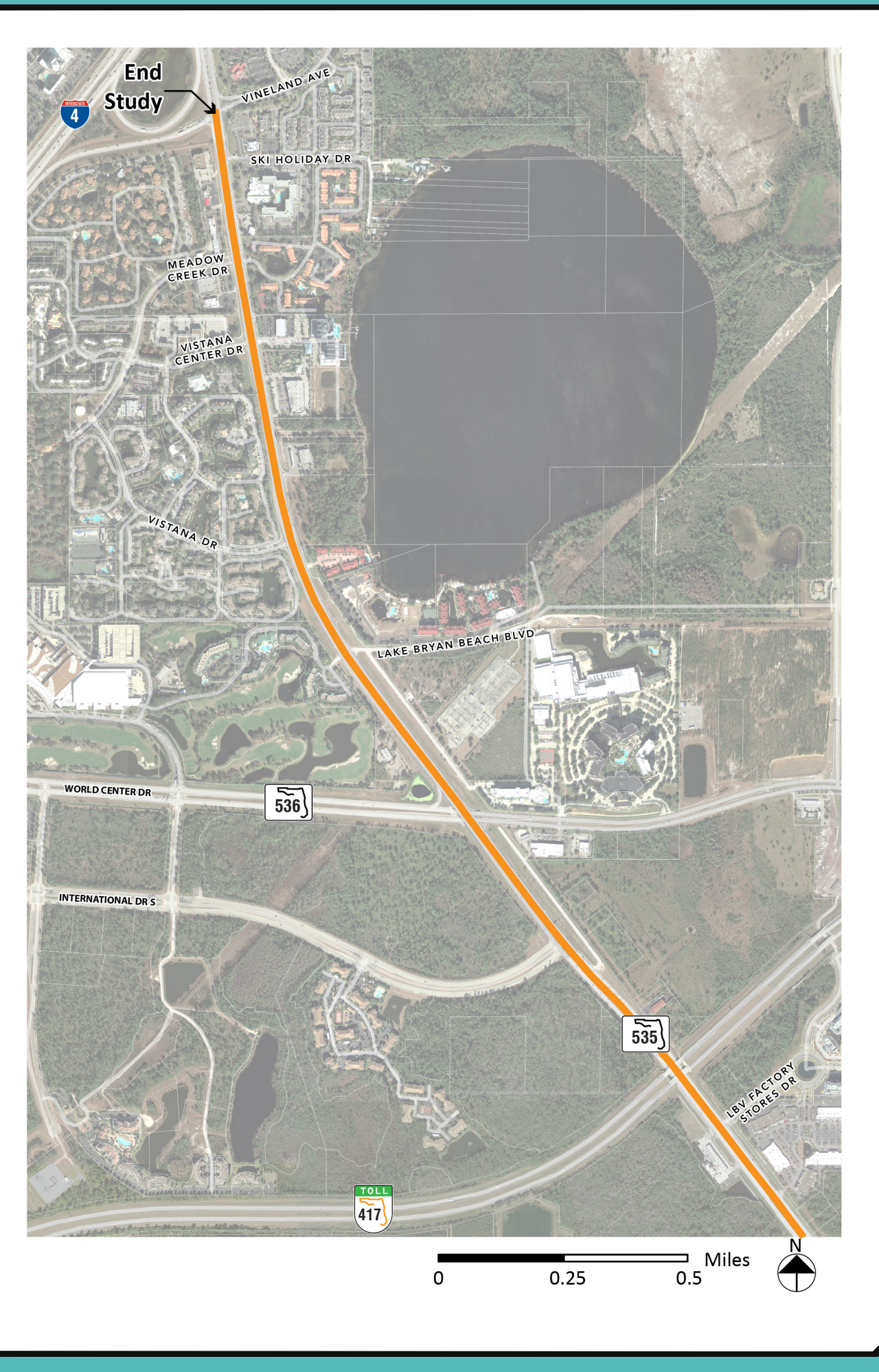
Aerial Image Fly Date: March 2016