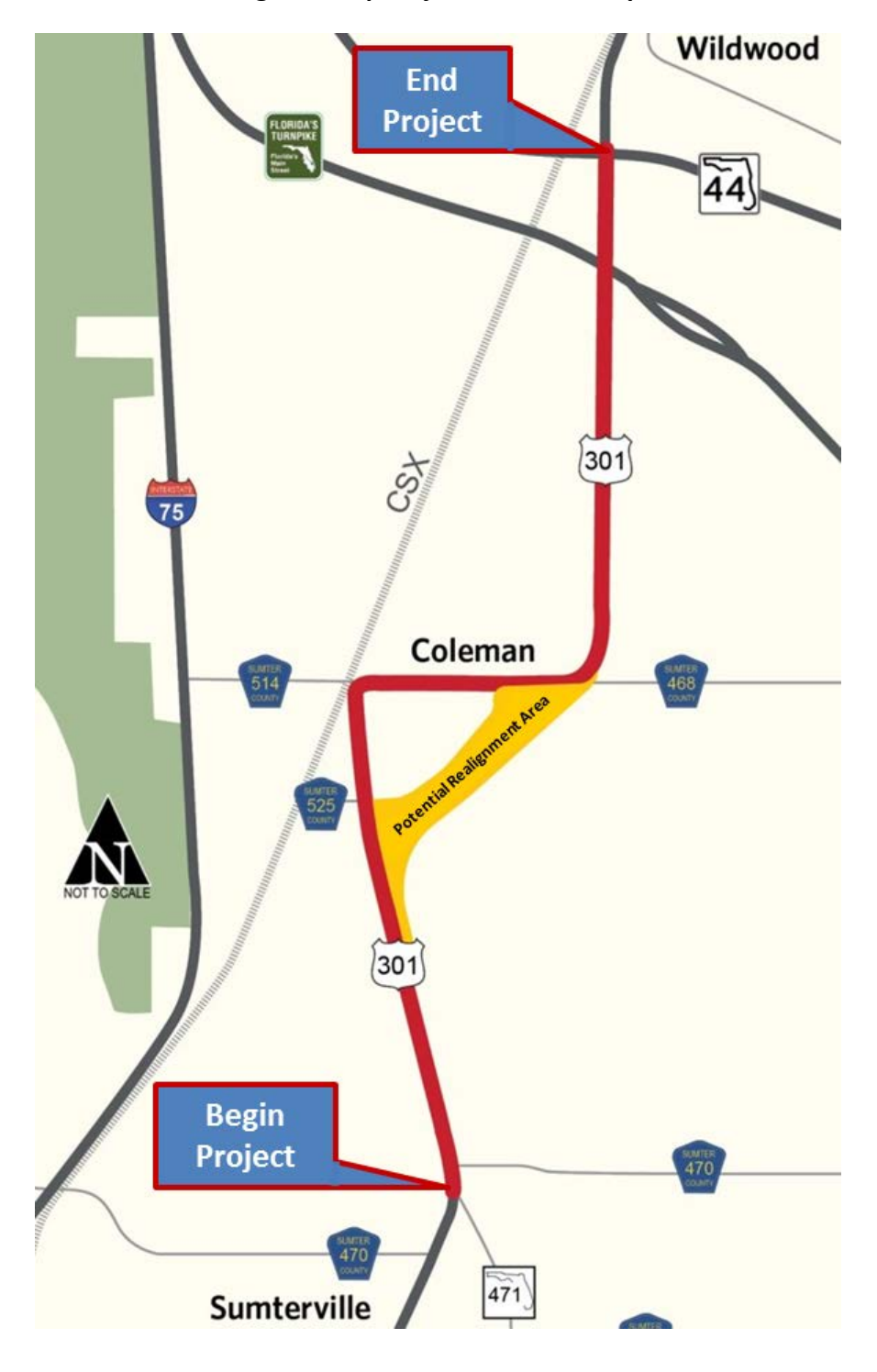
Figure 1-1 | Project Location Map