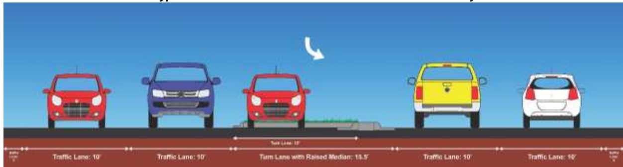
Typical Section 1: 15.5' Center Median with Left Turn Bay

Below are images illustrating the typical sections that the Project Visioning Team created using our Typical Section Tool.